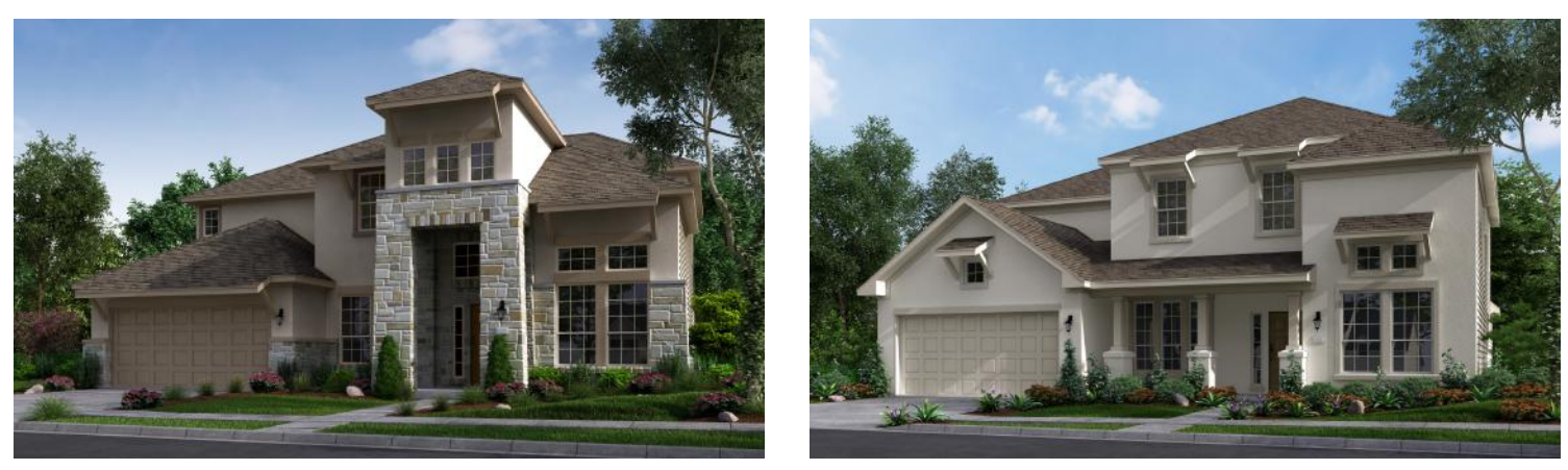
ELEVATION E (Shown with Optional Stucco & Stone)