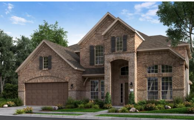
ELEVATION B (Shown with Optional Stone)