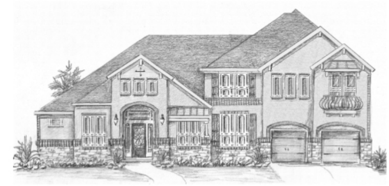
ELEVATION - N