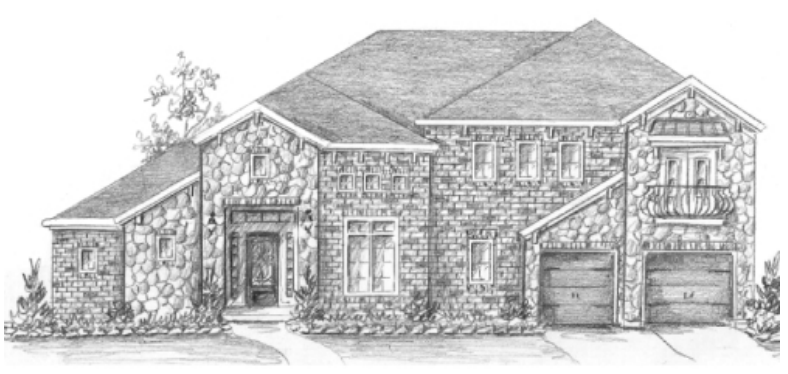
ELEVATION - V

Elevations are artist renderings and some minor changes may occur after the rendering has been produced. See sales counselor for current elevations.