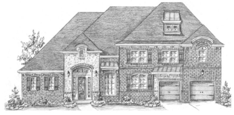
ELEVATION - U