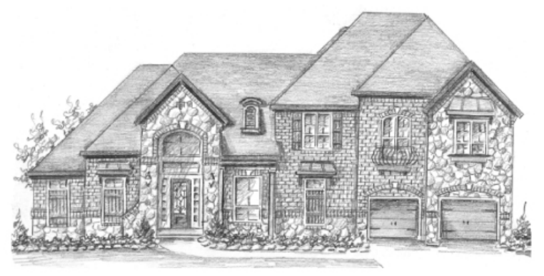
ELEVATION - S