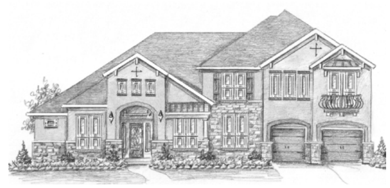
ELEVATION - T