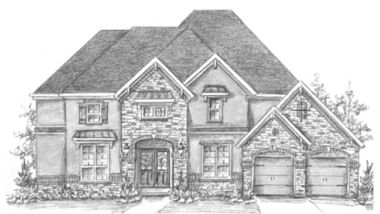
ELEVATION - T