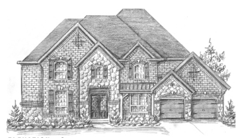
ELEVATION - S