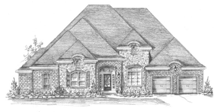
ELEVATION - V

Elevations are artist renderings and some minor changes may occur after the rendering has been produced. See sales counselor for current elevations.