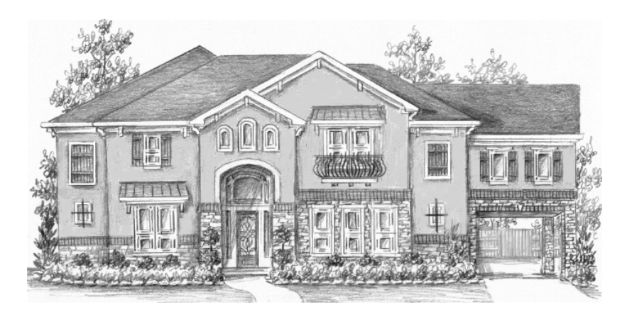
ELEVATION - S

Elevations are artist renderings and some minor changes may occur after the rendering has been produced. See sales counselor for current elevations.