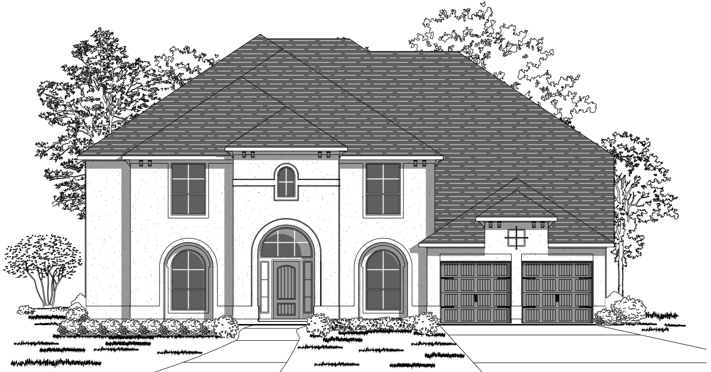
Design 4199S E-1