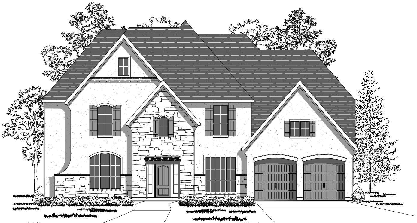
Design 4199S E-70

This design, as originally designed and prior to any changes you make, is estimated to yield approximately the number of square feet shown on page 1. All dimensions are approximate. Square footage may vary based on as-built dimensions, configurations, plan options and/or the method of calculation. Designs are not-to-scale, and are conceptual illustrations that may differ from construction plans or completed improvements. A design may depict features not available on all homesites or in all communities. Perry Homes reserves the right to make changes in plans and specifications, and to substitute material of similar quality. Prices, terms, promotions, plans, dimensions, features, options, amenities, elevations, designs, square footages, specifications, materials, and availability of homes or communities are subject to change without notice or obligation. All obligations will be governed by a written contract. This design does not constitute a commitment to build a particular floor plan or home in any given community. Some floor plans, options, and/or elevations may not be available on certain homesites or in a particular community and may require additional charges. Please check with Perry Homes to verify current offerings in the communities you are considering. This rendering is the property of Perry Homes, LLC. Any reproduction or exhibition is strictly prohibited. © Perry Homes, LLC 2014