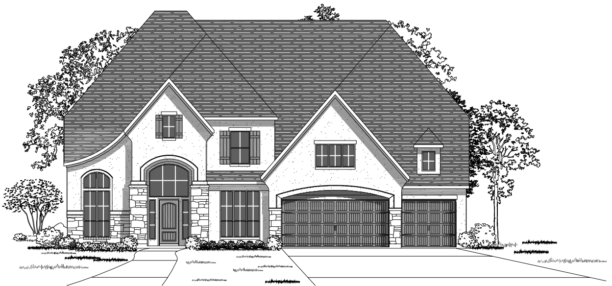
Design 4191S E-2 Includes Large Front Porch