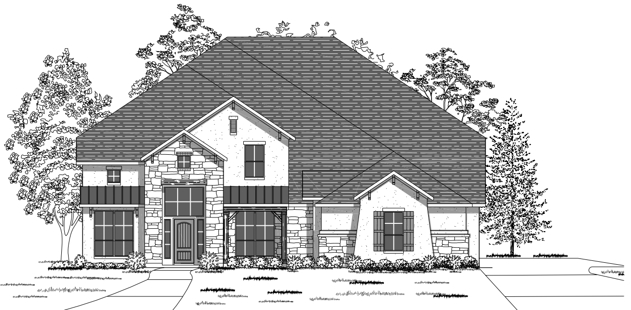
Design 4191S E-100 Includes Large Front Porch This elevation is exclusive to acreage communities.

This design, as originally designed and prior to any changes you make, is estimated to yield approximately the number of square feet shown on page 1. All dimensions are approximate. Square footage may vary based on as-built dimensions, configurations, plan options and/or the method of calculation. Designs are not-to-scale, and are conceptual illustrations that may differ from construction plans or completed improvements. A design may depict features not available on all homesites or in all communities. Perry Homes reserves the right to make changes in plans and specifications, and to substitute material of similar quality. Prices, terms, promotions, plans, dimensions, features, options, amenities, elevations, designs, square footages, specifications, materials, and availability of homes or communities are subject to change without notice or obligation. All obligations will be governed by a written contract. This design does not constitute a commitment to build a particular floor plan or home in any given community. Some floor plans, options, and/or elevations may not be available on certain homesites or in a particular community and may require additional charges. Please check with Perry Homes to verify current offerings in the communities you are considering. This rendering is the property of Perry Homes, LLC. Any reproduction or exhibition is strictly prohibited.