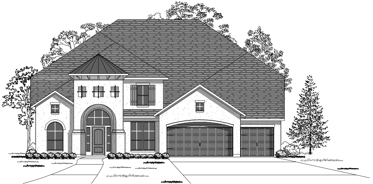
Design 4191S E-1 Includes Large Front Porch