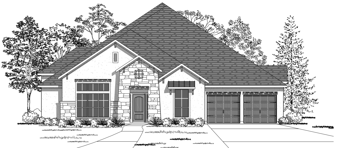
Design 3714S E-50