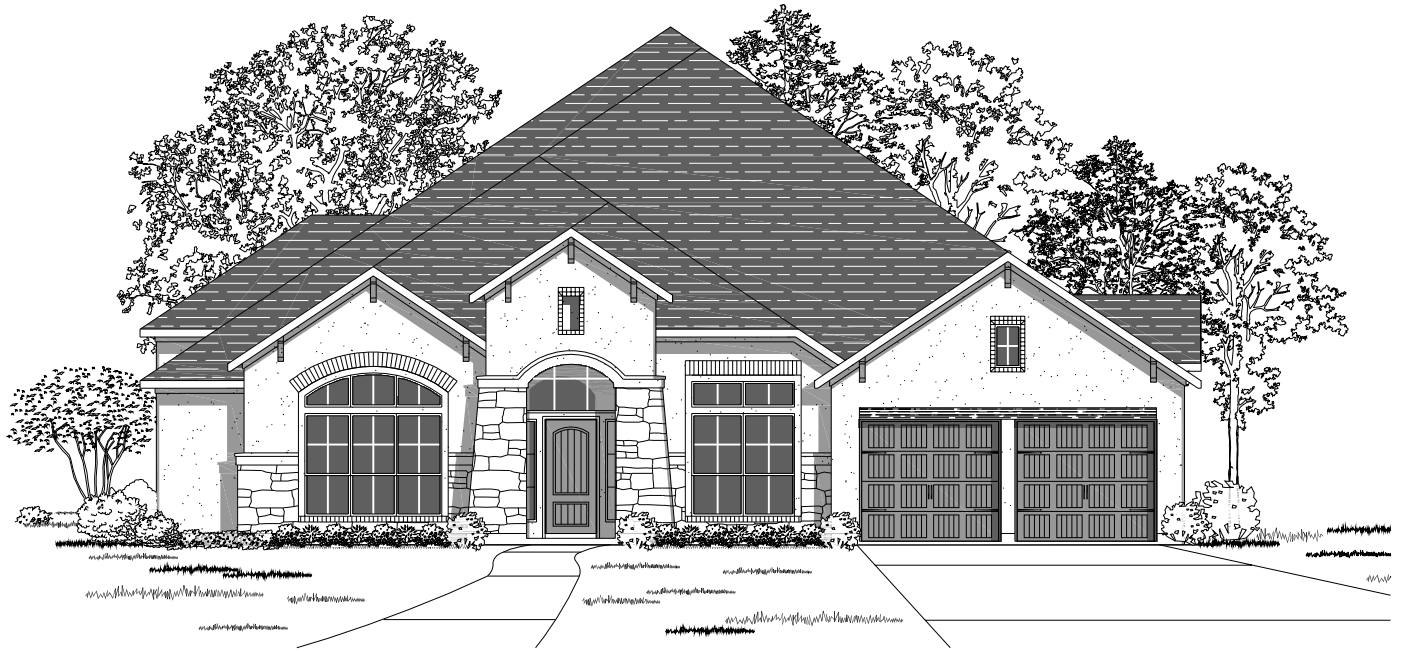
Design 3714S E-1