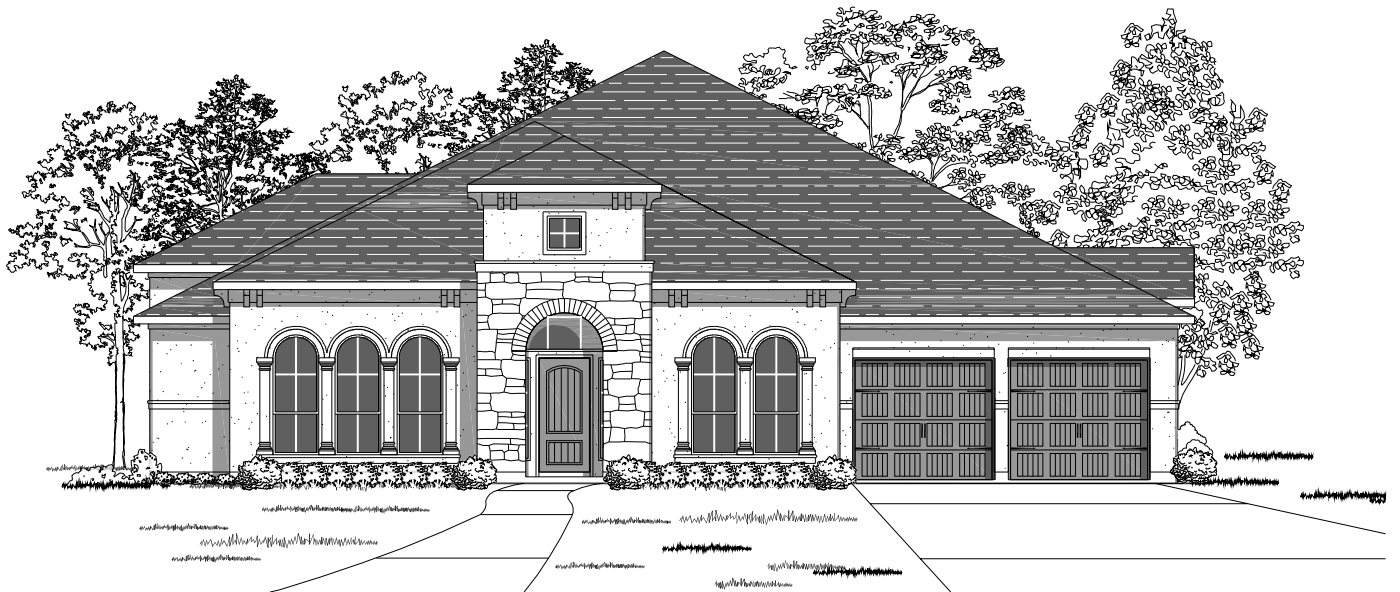
Design 3714S E-2