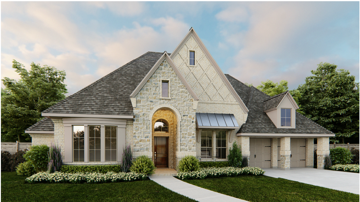
Design 3525W E-101