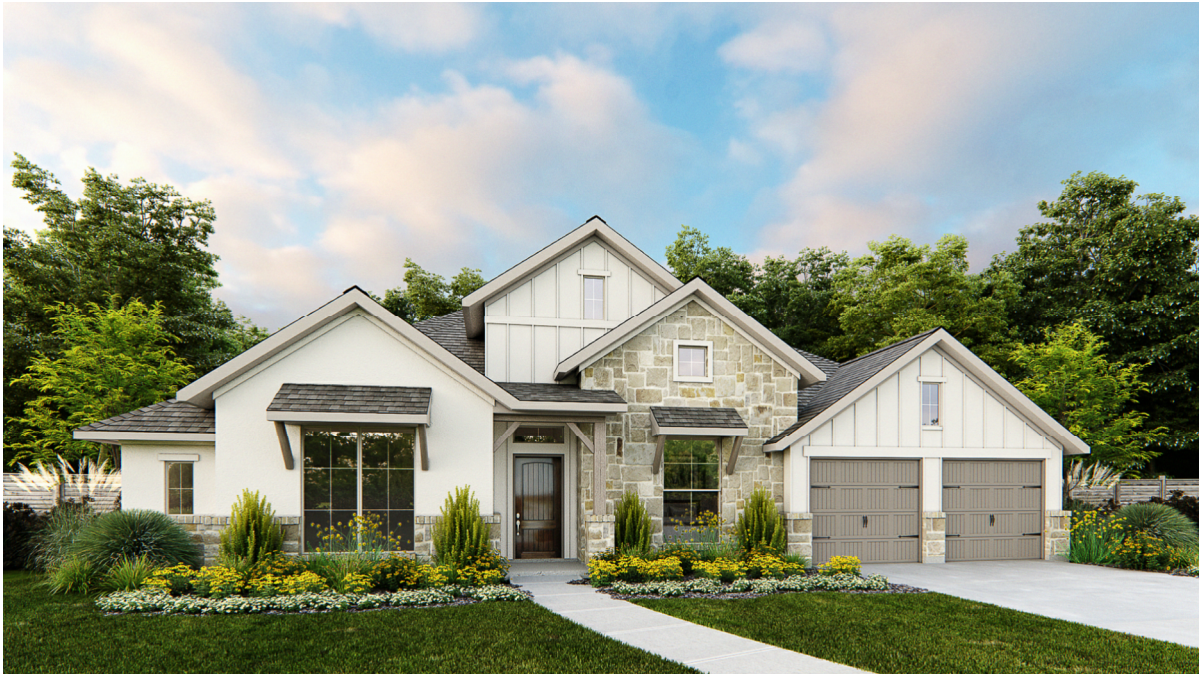
Design 3525W E-30

This design, as originally designed and prior to any changes you make, is estimated to yield approximately the number of square feet shown on page 1. All dimensions are approximate. Square footage may vary based on as-built dimensions, configurations, plan options and/or the method of calculation. Designs are not-to-scale, and are conceptual illustrations that may differ from construction plans or completed improvements. A design may depict features not available on all homesites or in all communities. Perry Homes reserves the right to make changes in plans and specifications, and to substitute material of similar quality. Prices, terms, promotions, plans, dimensions, features, options, amenities, elevations, designs, square footages, specifications, materials, and availability of homes or communities are subject to change without notice or obligation. All obligations will be governed by a written contract. This design does not constitute a commitment to build a particular floor plan or home in any given community. Some floor plans, options, and/or elevations may not be available on certain homesites or in a particular community and may require additional charges. Please check with Perry Homes to verify current offerings in the communities you are considering. This rendering is the property of Perry Homes, LLC. Any reproduction or exhibition is strictly prohibited.