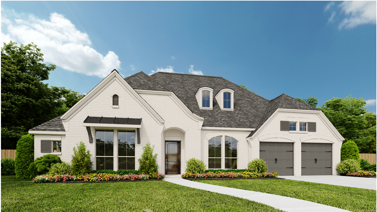
Design 3525W E-1