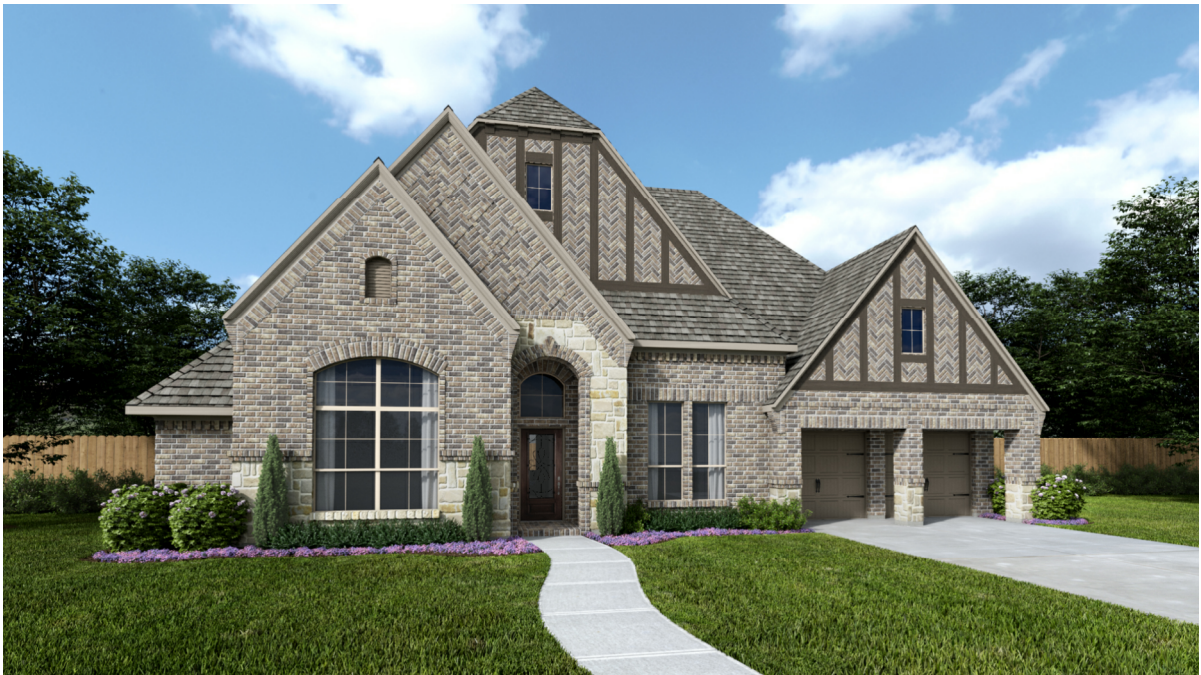
Design 3525W E-100