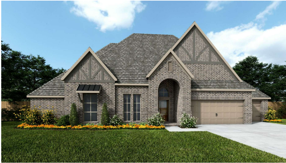
Design 3478W E-1