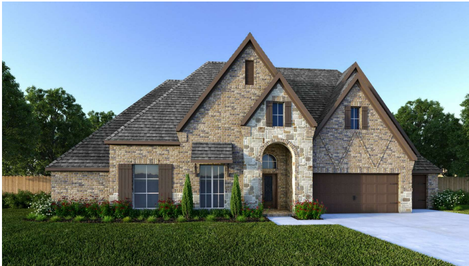
Design 3478W E-70

This design, as originally designed and prior to any changes you make, is estimated to yield approximately the number of square feet shown on page 1. All dimensions are approximate. Square footage may vary based on as-built dimensions, configurations, plan options and/or the method of calculation. Designs are not-to-scale, and are conceptual illustrations that may differ from construction plans or completed improvements. A design may depict features not available on all homesites or in all communities. Perry Homes reserves the right to make changes in plans and specifications, and to substitute material of similar quality. Prices, terms, promotions, plans, dimensions, features, options, amenities, elevations, designs, square footages, specifications, materials, and availability of homes or communities are subject to change without notice or obligation. All obligations will be governed by a written contract. This design does not constitute a commitment to build a particular floor plan or home in any given community. Some floor plans, options, and/or elevations may not be available on certain homesites or in a particular community and may require additional charges. Please check with Perry Homes to verify current offerings in the communities you are considering. This rendering is the property of Perry Homes, LLC. Any reproduction or exhibition is strictly prohibited. © Perry Homes, LLC 2018