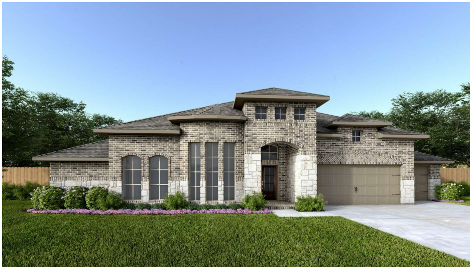
Design 3478W E-30