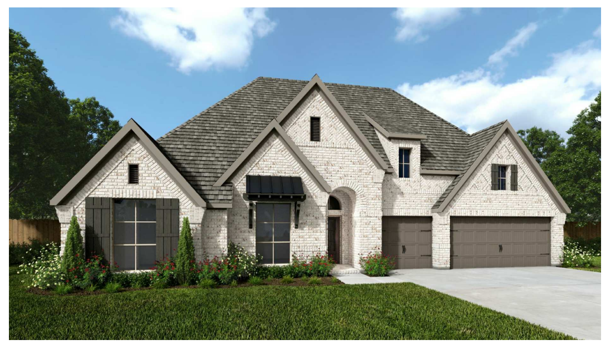
Design 3410W E-1