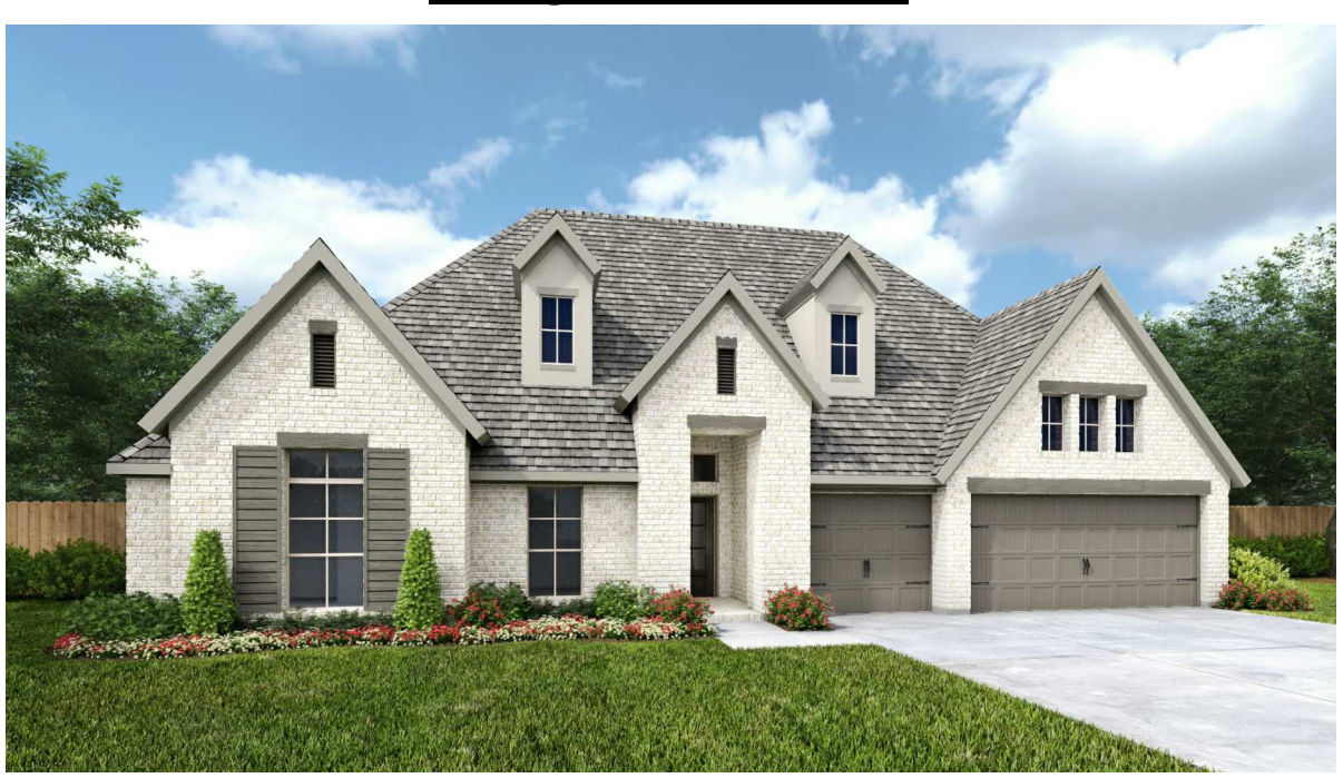
Design 3410W E-30