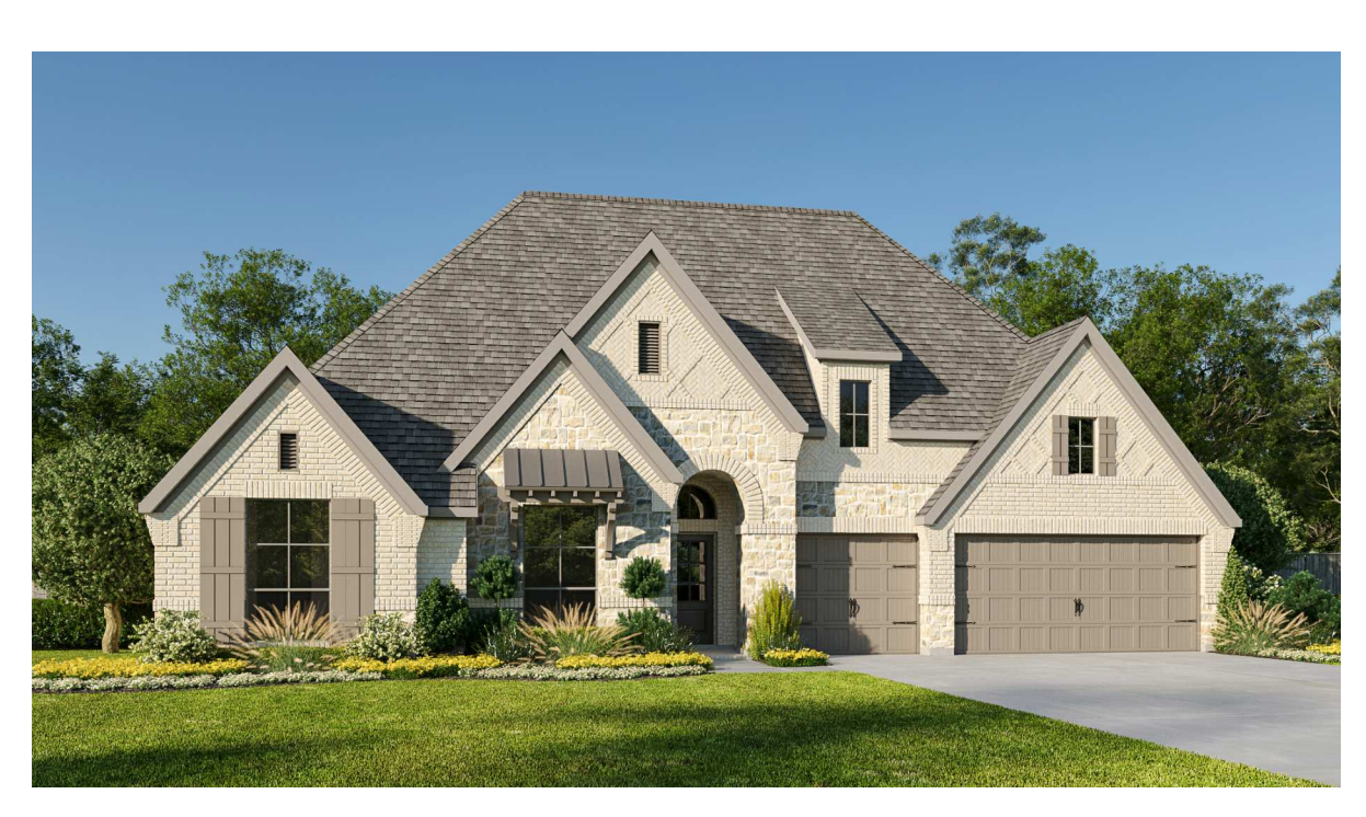
Design 3410W E51

This design, as originally designed and prior to any changes you make, is estimated to yield approximately the number of square feet shown on page 1. All dimensions are approximate. Square footage may vary based on as-built dimensions, configurations, plan options and/or the method of calculation. Designs are not-to-scale, and are conceptual illustrations that may differ from construction plans or completed improvements. A design may depict features not available on all homesites or in all communities. Perry Homes reserves the right to make changes in plans and specifications, and to substitute material of similar quality. Prices, terms, promotions, plans, dimensions, features, options, amenities, elevations, designs, square footages, specifications, materials, and availability of homes or communities are subject to change without notice or obligation. All obligations will be governed by a written contract. This design does not constitute a commitment to build a particular floor plan or home in any given community. Some floor plans, options, and/or elevations may not be available on certain homesites or in a particular community and may require additional charges. Please check with Perry Homes to verify current offerings in the communities you are considering. This rendering is the property of Perry Homes, LLC. Any reproduction or exhibition is strictly prohibited.