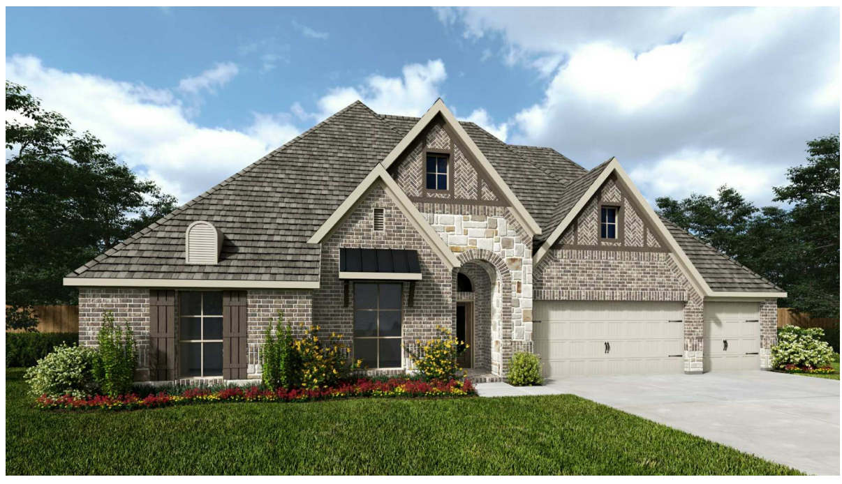
Design 3410W E-31