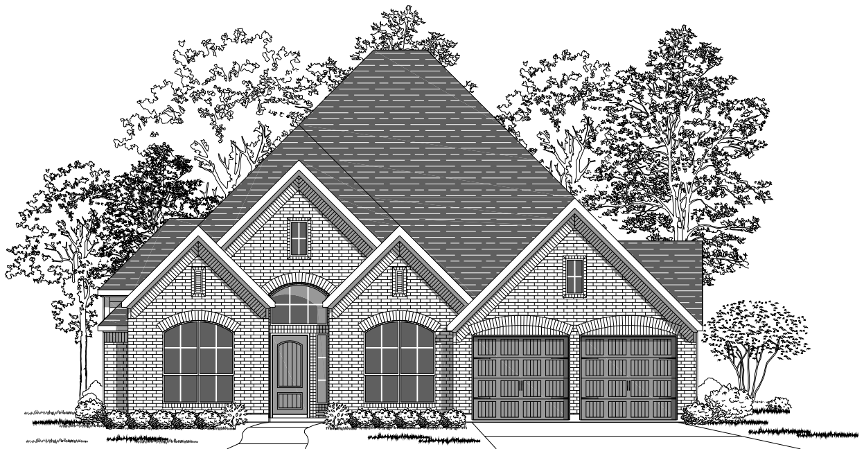
Design 3258W E-1