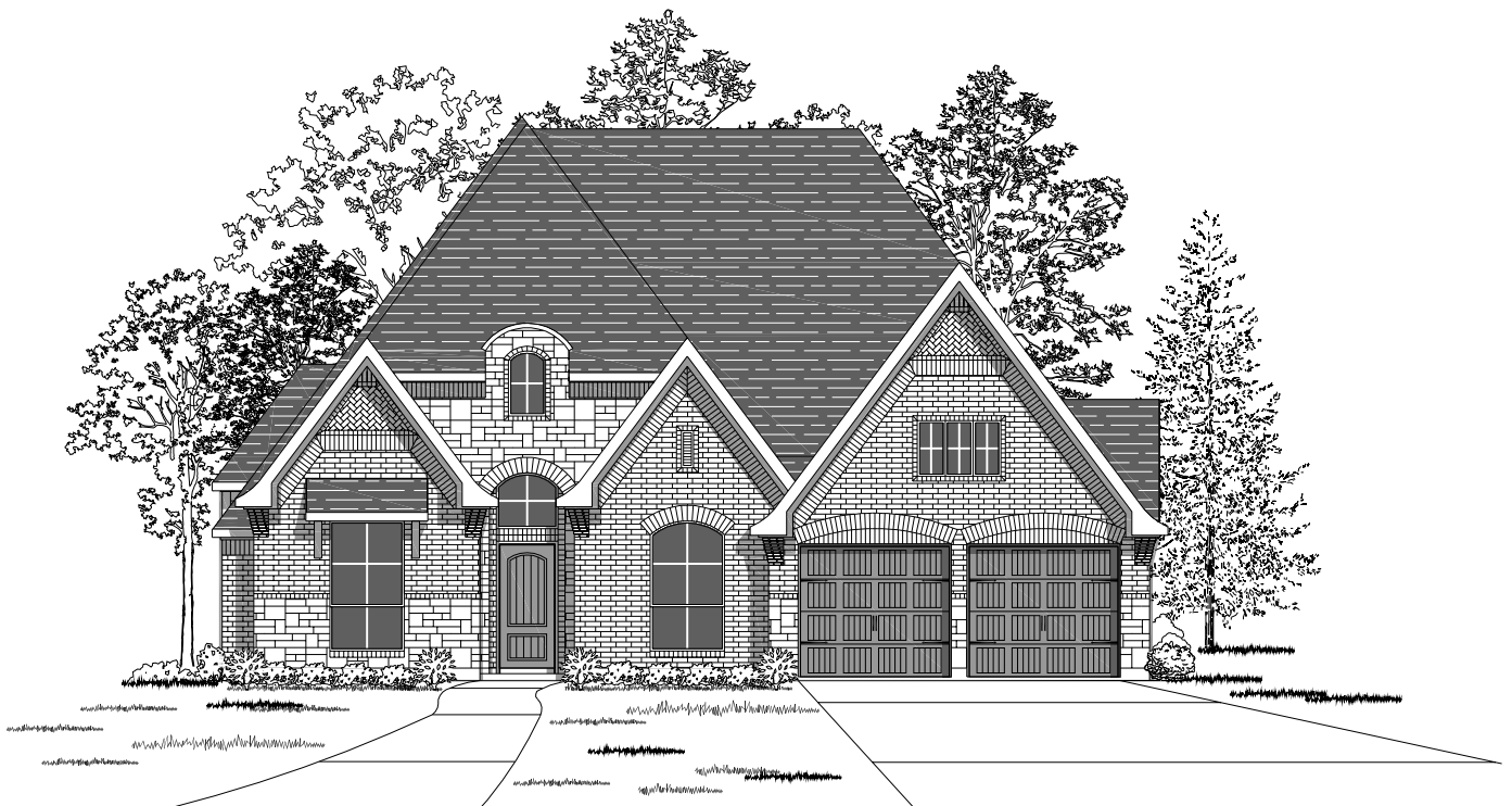
Design 3258W E-71