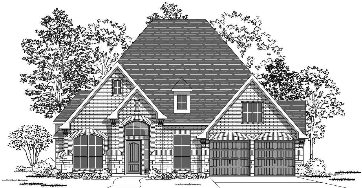
Design 3258W E-50