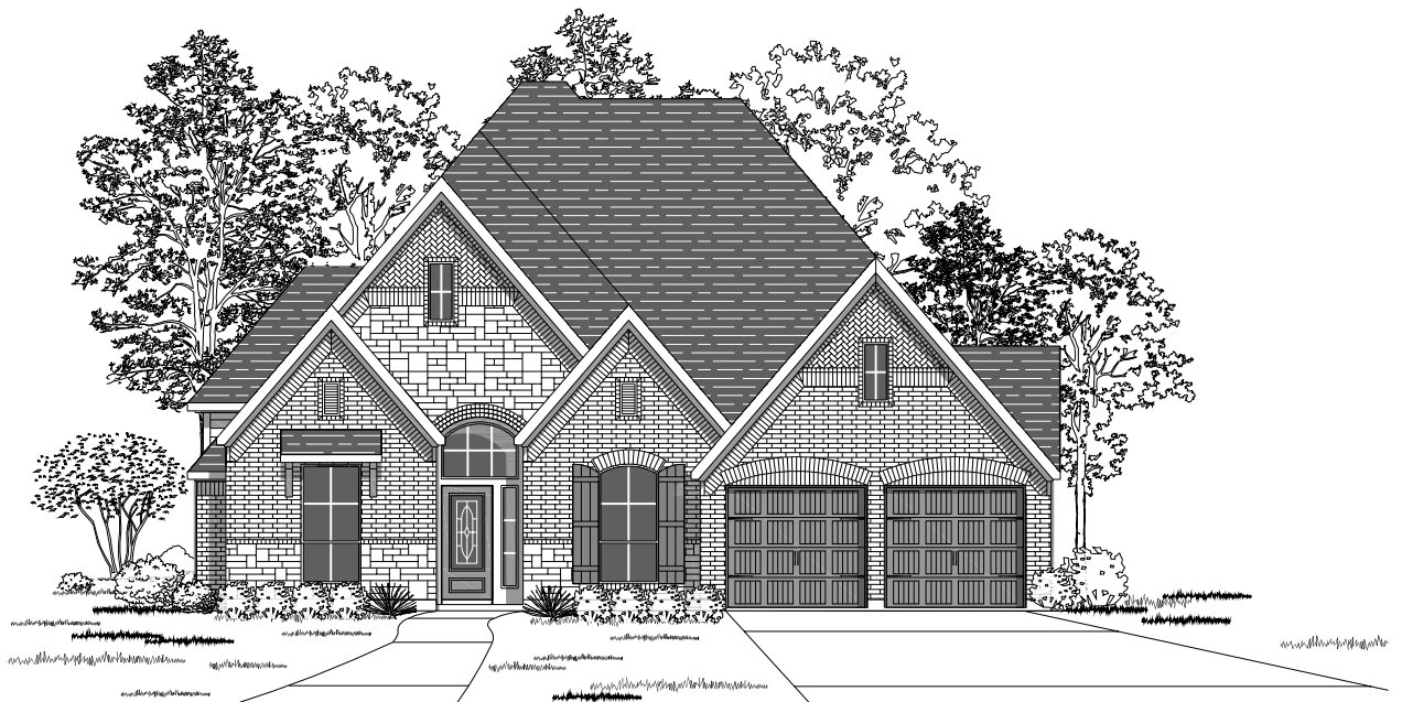
Design 3145W E-70

This design, as originally designed and prior to any changes you make, is estimated to yield approximately the number of square feet shown on page 1. All dimensions are approximate. Square footage may vary based on as-built dimensions, configurations, plan options and/or the method of calculation. Designs are not-to-scale, and are conceptual illustrations that may differ from construction plans or completed improvements. A design may depict features not available on all homesites or in all communities. Perry Homes reserves the right to make changes in plans and specifications, and to substitute material of similar quality. Prices, terms, promotions, plans, dimensions, features, options, amenities, elevations, designs, square footages, specifications, materials, and availability of homes or communities are subject to change without notice or obligation. All obligations will be governed by a written contract. This design does not constitute a commitment to build a particular floor plan or home in any given community. Some floor plans, options, and/or elevations may not be available on certain homesites or in a particular community and may require additional charges. Please check with Perry Homes to verify current offerings in the communities you are considering. This rendering is the property of Perry Homes, LLC. Any reproduction or exhibition is strictly prohibited.