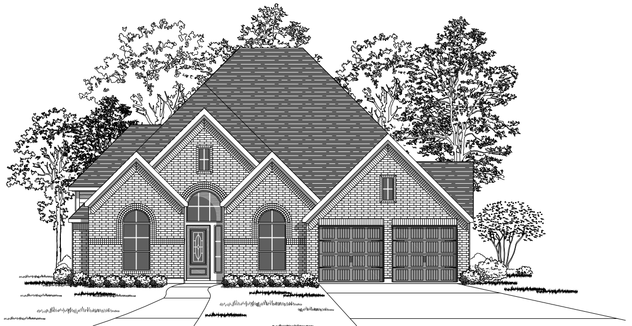
Design 3145W E-1