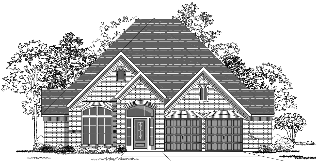
Design 3117W E-1