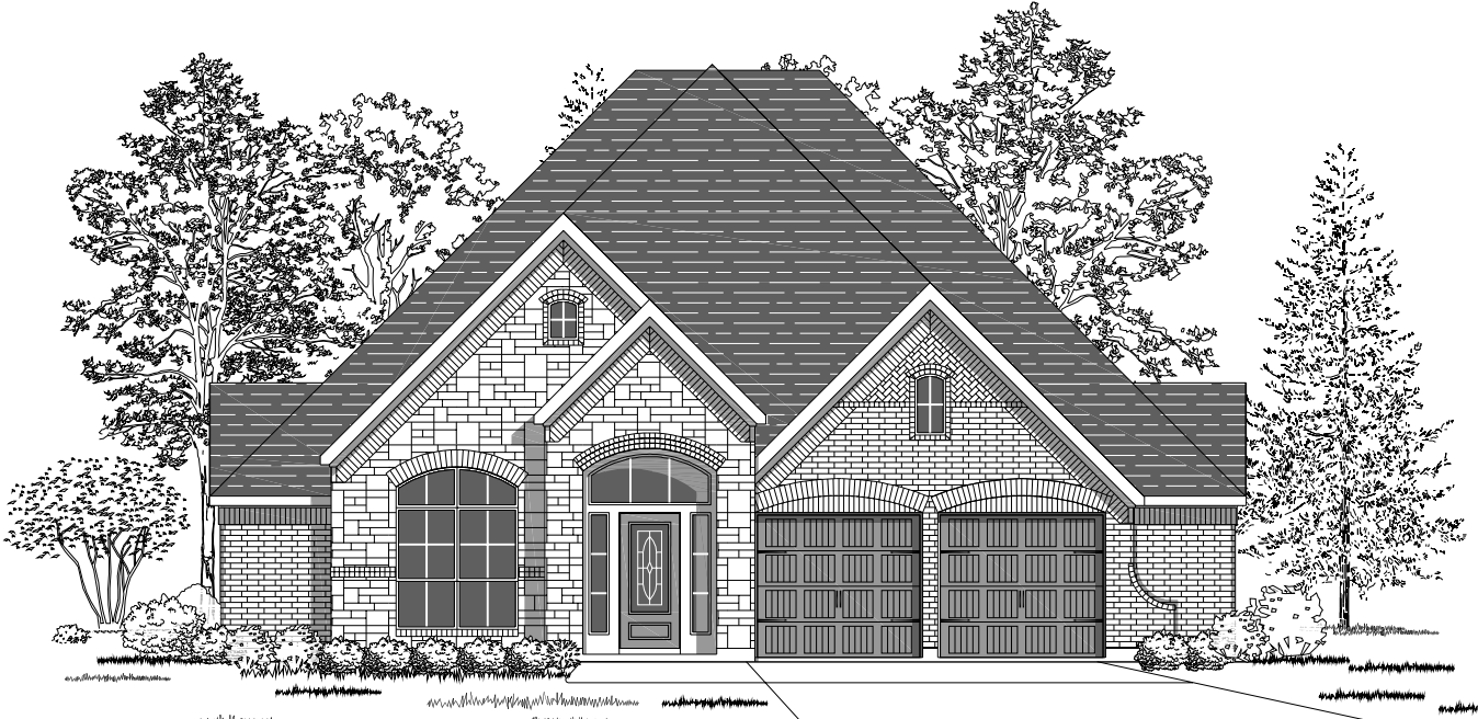
Design 3117W E-50