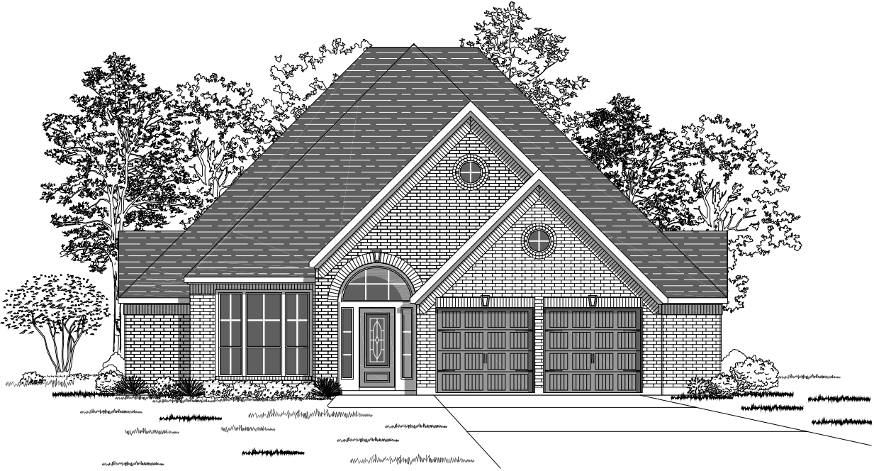
Design 3117W E-2