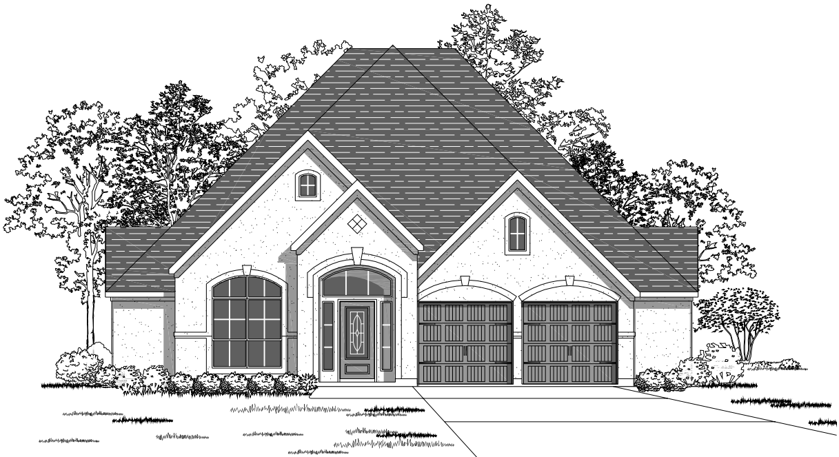
Design 3117W E-70