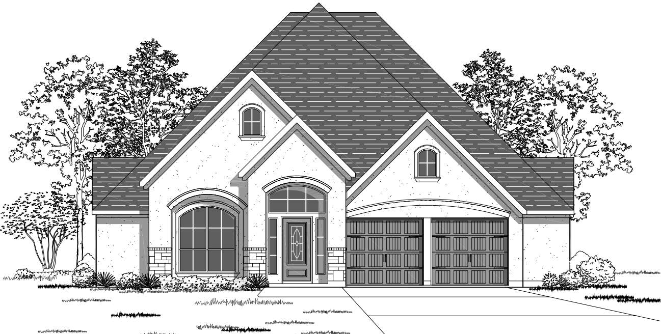
Design 3117W E-100

Includes Stucco Front Includes Large Front Porch