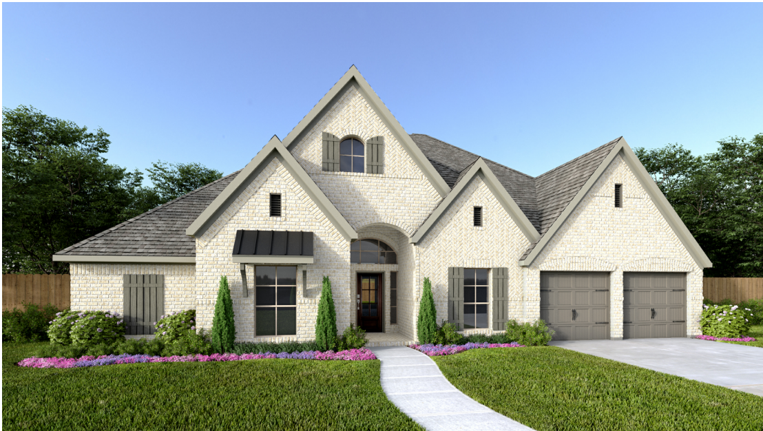
Design 3063W E-1