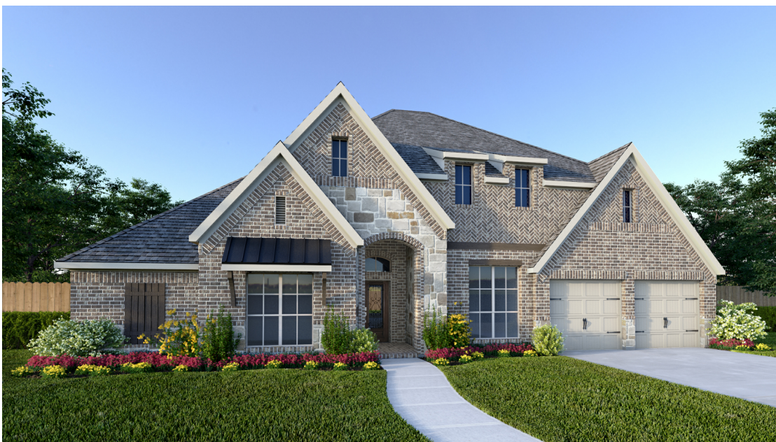
Design 3063W E-71

This design, as originally designed and prior to any changes you make, is estimated to yield approximately the number of square feet shown on page 1. All dimensions are approximate. Square footage may vary based on as-built dimensions, configurations, plan options and/or the method of calculation. Designs are not-to-scale, and are conceptual illustrations that may differ from construction plans or completed improvements. A design may depict features not available on all homesites or in all communities. Perry Homes reserves the right to make changes in plans and specifications, and to substitute material of similar quality. Prices, terms, promotions, plans, dimensions, features, options, amenities, elevations, designs, square footages, specifications, materials, and availability of homes or communities are subject to change without notice or obligation. All obligations will be governed by a written contract. This design does not constitute a commitment to build a particular floor plan or home in any given community. Some floor plans, options, and/or elevations may not be available on certain homesites or in a particular community and may require additional charges. Please check with Perry Homes to verify current offerings in the communities you are considering. This rendering is the property of Perry Homes, LLC. Any reproduction or exhibition is strictly prohibited.