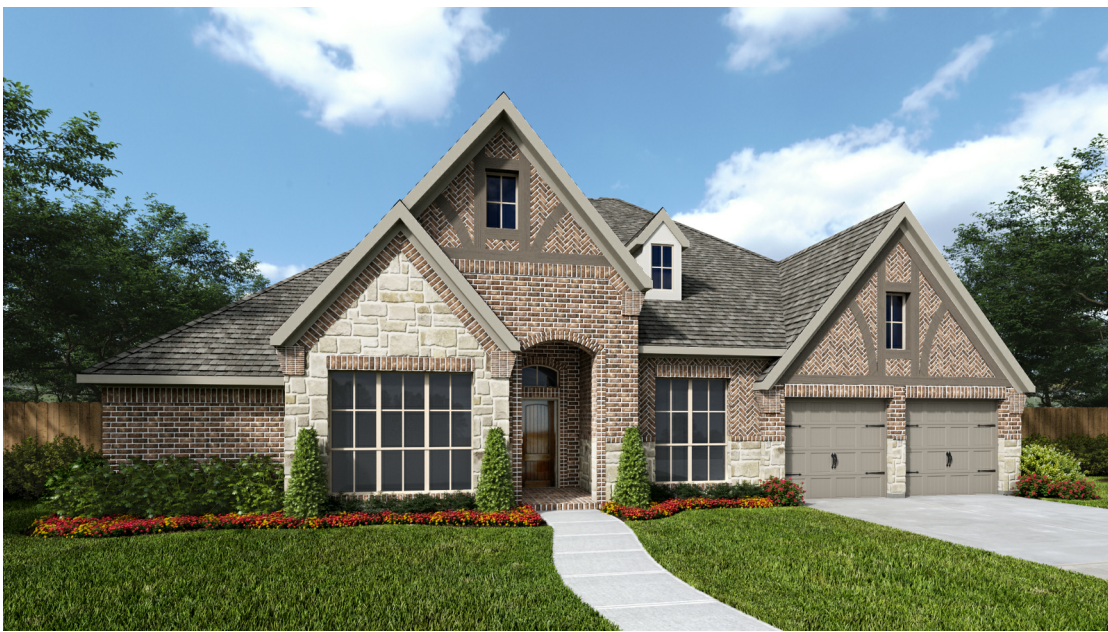
Design 3063W E-51