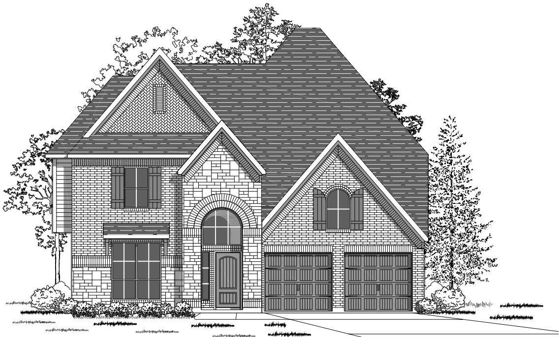
Design 2997W E-73