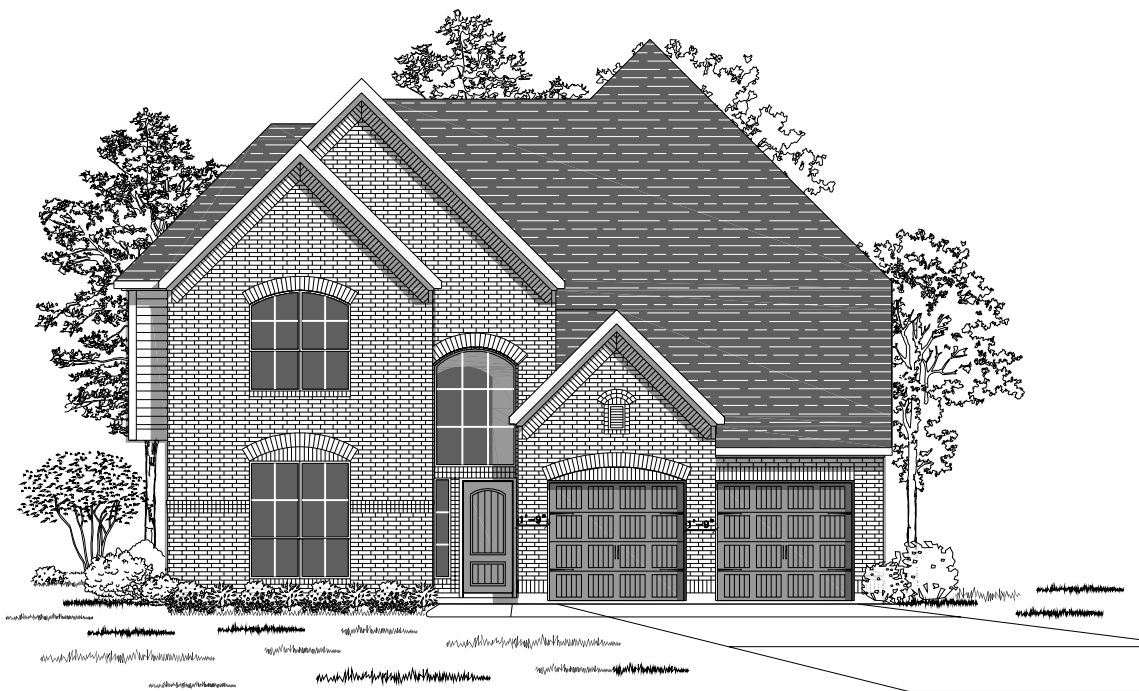
Design 2997W E-3