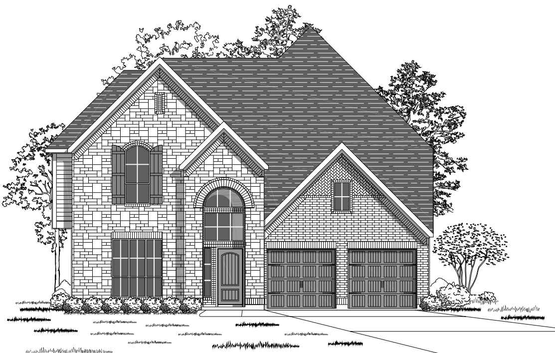
Design 2997W E-72