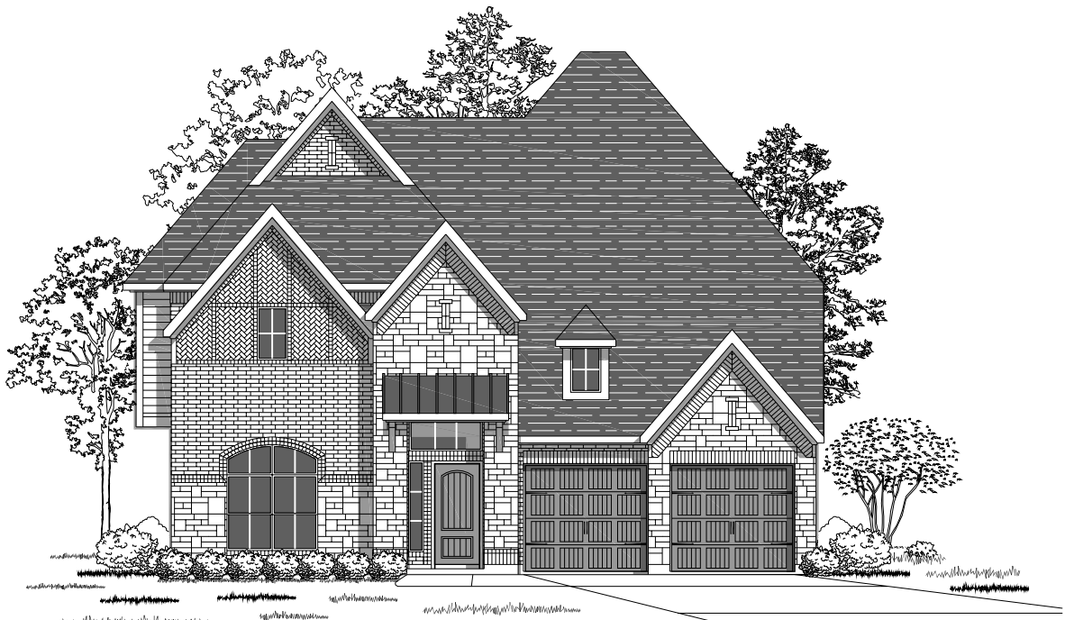
Design 2997W E-100

This design, as originally designed and prior to any changes you make, is estimated to yield approximately the number of square feet shown on page 1. All dimensions are approximate. Square footage may vary based on as-built dimensions, configurations, plan options and/or the method of calculation. Designs are not-to-scale, and are conceptual illustrations that may differ from construction plans or completed improvements. A design may depict features not available on all homesites or in all communities. Perry Homes reserves the right to make changes in plans and specifications, and to substitute material of similar quality. Prices, terms, promotions, plans, dimensions, features, options, amenities, elevations, designs, square footages, specifications, materials, and availability of homes or communities are subject to change without notice or obligation. All obligations will be governed by a written contract. This design does not constitute a commitment to build a particular floor plan or home in any given community. Some floor plans, options, and/or elevations may not be available on certain homesites or in a particular community and may require additional charges. Please check with Perry Homes to verify current offerings in the communities you are considering. This rendering is the property of Perry Homes, LLC. Any reproduction or exhibition is strictly prohibited.