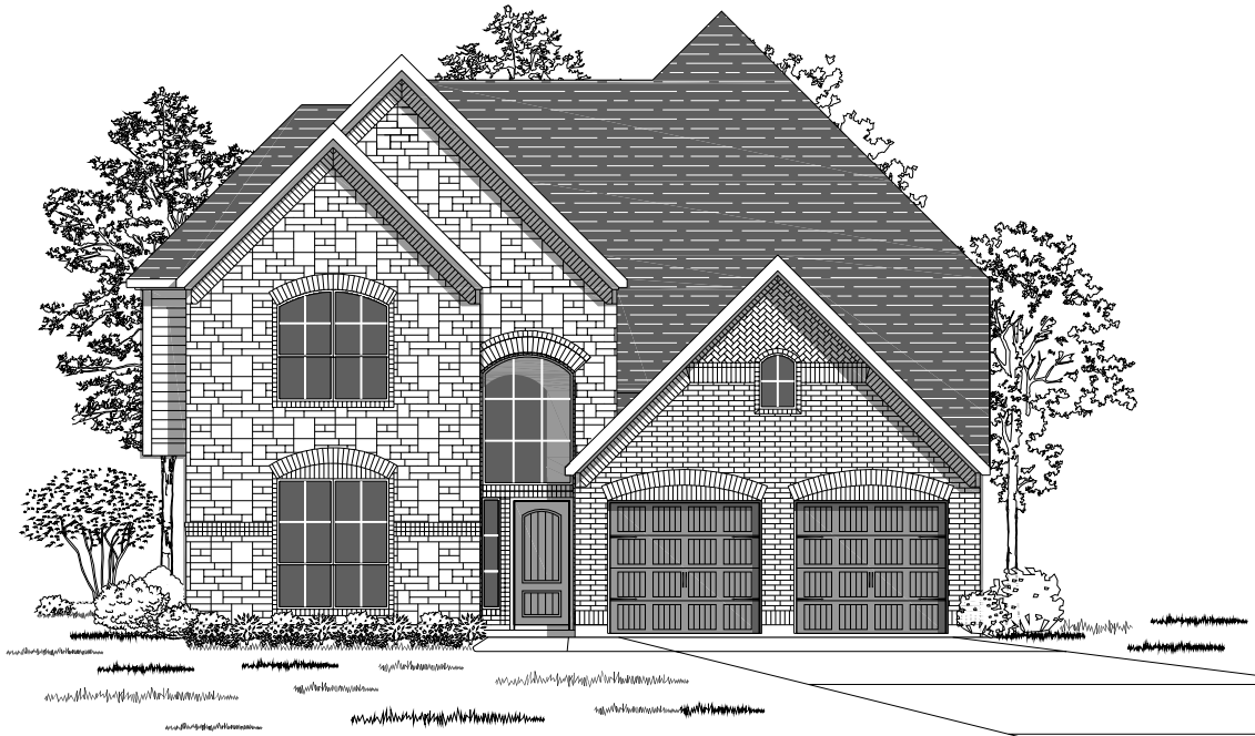
Design 2997W E-52