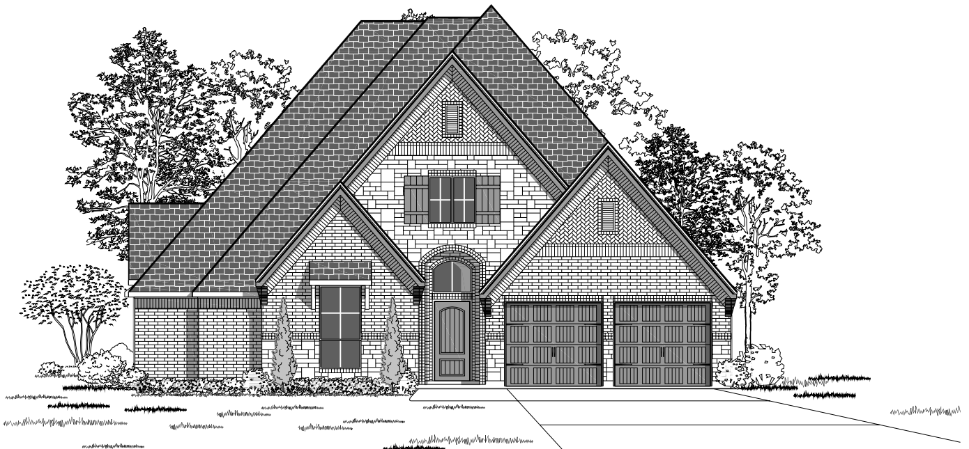
Design 2916W E-70