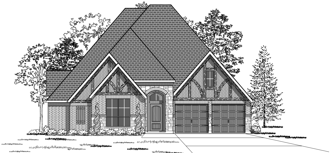
Design 2916W E-71

This design, as originally designed and prior to any changes you make, is estimated to yield approximately the number of square feet shown on page 1. All dimensions are approximate. Square footage may vary based on as-built dimensions, configurations, plan options and/or the method of calculation. Designs are not-to-scale, and are conceptual illustrations that may differ from construction plans or completed improvements. A design may depict features not available on all homesites or in all communities. Perry Homes reserves the right to make changes in plans and specifications, and to substitute material of similar quality. Prices, terms, promotions, plans, dimensions, features, options, amenities, elevations, designs, square footages, specifications, materials, and availability of homes or communities are subject to change without notice or obligation. All obligations will be governed by a written contract. This design does not constitute a commitment to build a particular floor plan or home in any given community. Some floor plans, options, and/or elevations may not be available on certain homesites or in a particular community and may require additional charges. Please check with Perry Homes to verify current offerings in the communities you are considering. This rendering is the property of Perry Homes, LLC. Any reproduction or exhibition is strictly prohibited. © Perry Homes, LLC 2018