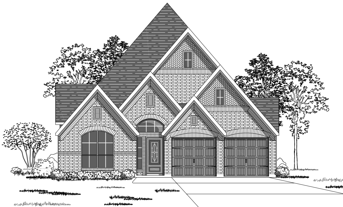
Design 2714W E-31