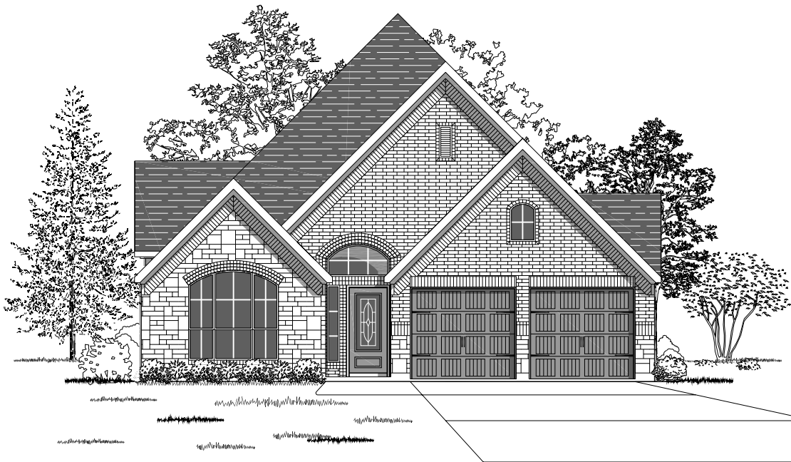
Design 2714W E-32