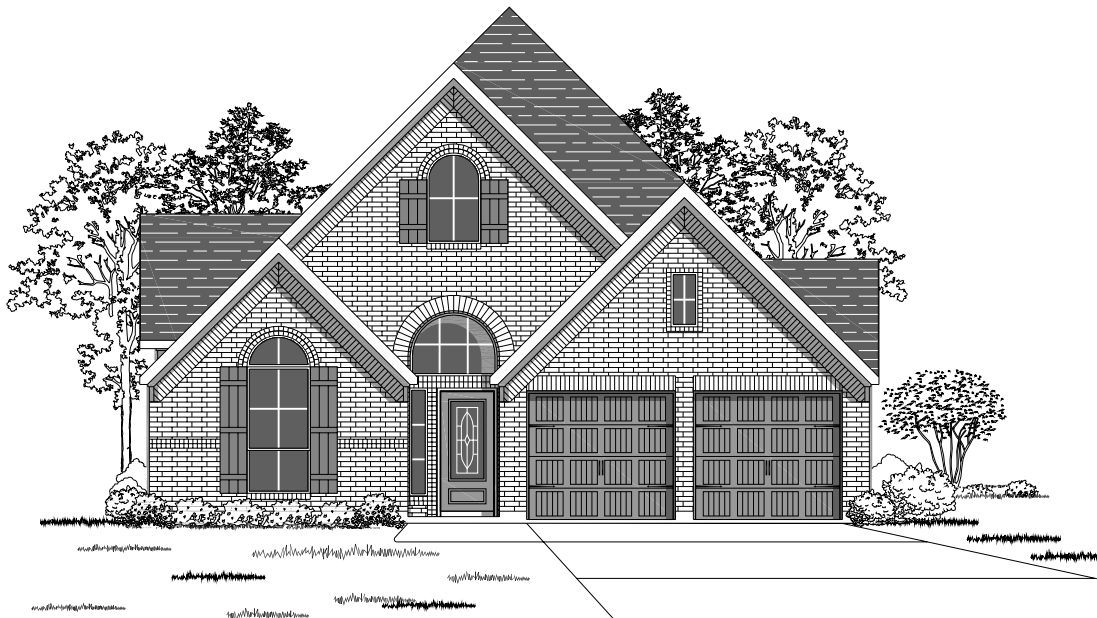
Design 2714W E-1