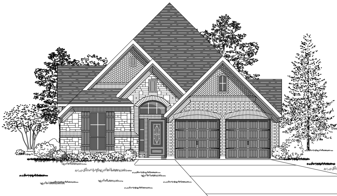
Design 2714W E-30

This design, as originally designed and prior to any changes you make, is estimated to yield approximately the number of square feet shown on page 1. All dimensions are approximate. Square footage may vary based on as-built dimensions, configurations, plan options and/or the method of calculation. Designs are not-to-scale, and are conceptual illustrations that may differ from construction plans or completed improvements. A design may depict features not available on all homesites or in all communities. Perry Homes reserves the right to make changes in plans and specifications, and to substitute material of similar quality. Prices, terms, promotions, plans, dimensions, features, options, amenities, elevations, designs, square footages, specifications, materials, and availability of homes or communities are subject to change without notice or obligation. All obligations will be governed by a written contract. This design does not constitute a commitment to build a particular floor plan or home in any given community. Some floor plans, options, and/or elevations may not be available on certain homesites or in a particular community and may require additional charges. Please check with Perry Homes to verify current offerings in the communities you are considering. This rendering is the property of Perry Homes, LLC. Any reproduction or exhibition is strictly prohibited.