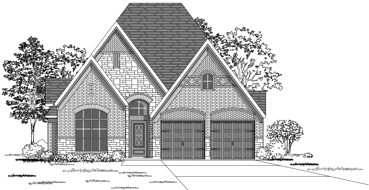
Design 2714W E-50