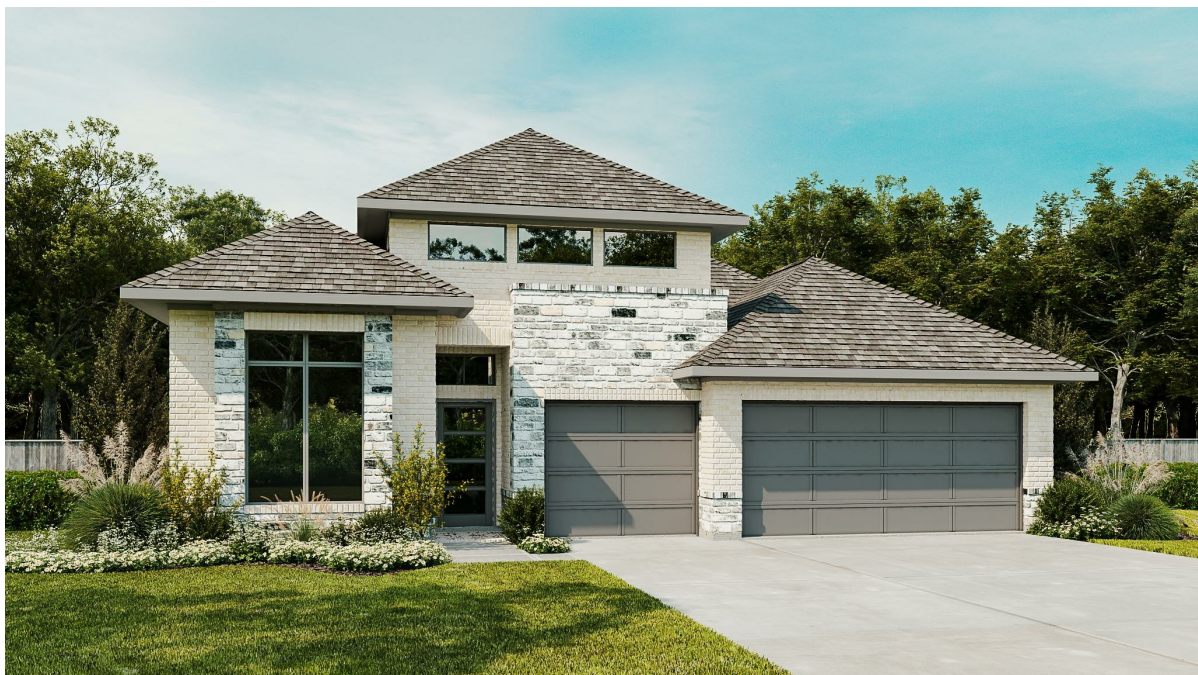
Design 2695W E-51

*See Page 3 for Details and Disclaimers. © Perry Homes, LLC 2019