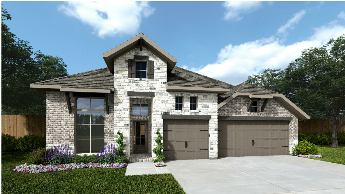
Design 2695W E-50