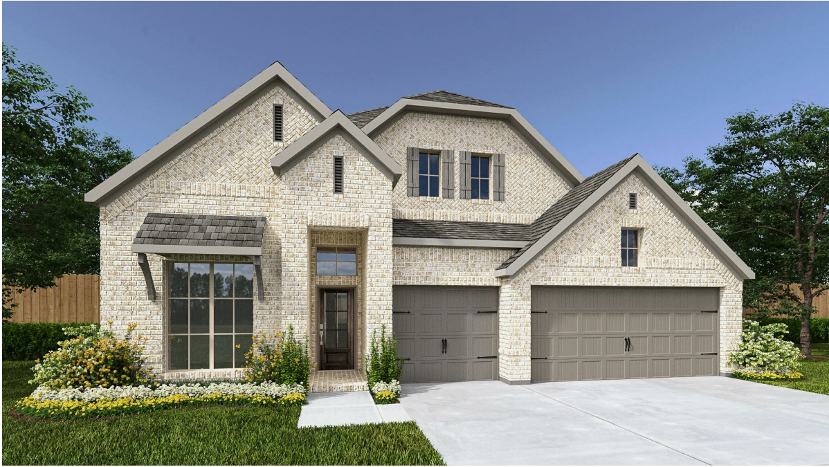
Design 2695W E-1