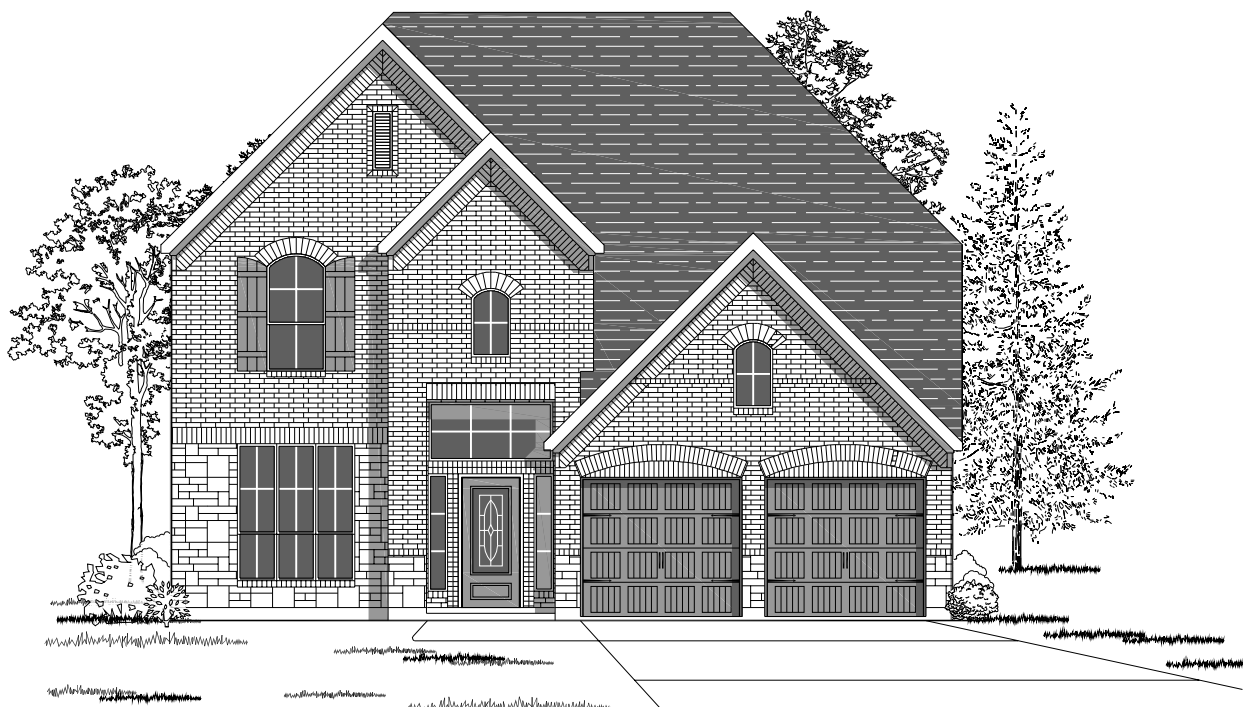
Design 2598W E-31

*See Page 3 for Details and Disclaimers. © Perry Homes, LLC 2016