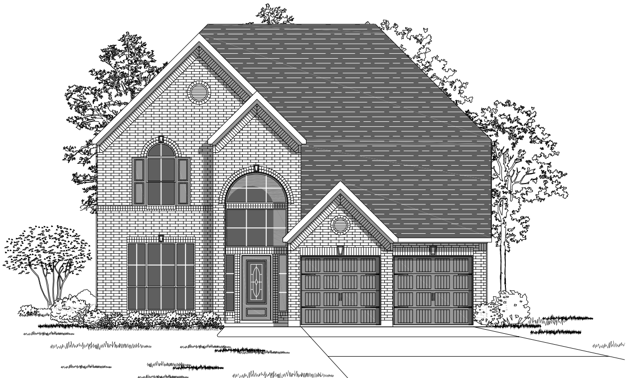
Design 2598W E-2