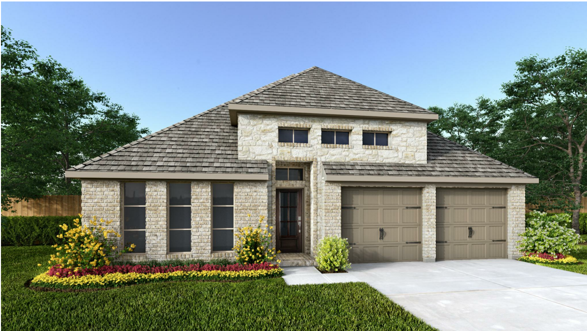
Design 2574W E-30