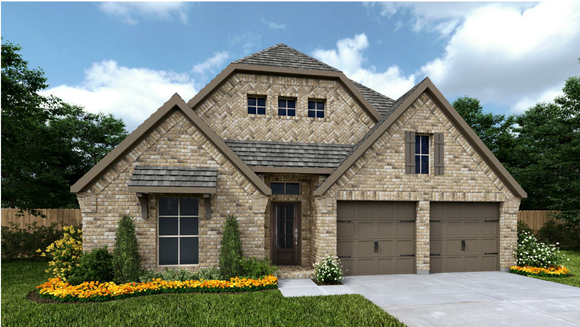
Design 2574W E-1