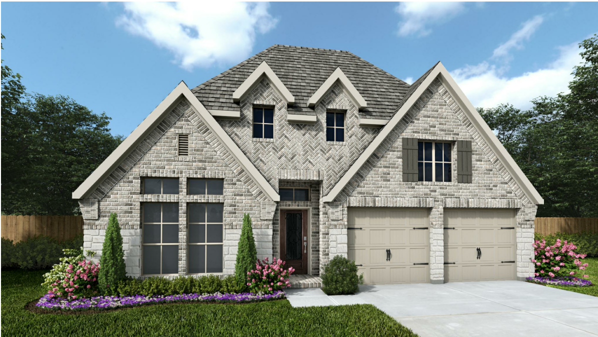
Design 2574W E-50

This design, as originally designed and prior to any changes you make, is estimated to yield approximately the number of square feet shown on page 1. All dimensions are approximate. Square footage may vary based on as-built dimensions, configurations, plan options and/or the method of calculation. Designs are not-to-scale, and are conceptual illustrations that may differ from construction plans or completed improvements. A design may depict features not available on all homesites or in all communities. Perry Homes reserves the right to make changes in plans and specifications, and to substitute material of similar quality. Prices, terms, promotions, plans, dimensions, features, options, amenities, elevations, designs, square footages, specifications, materials, and availability of homes or communities are subject to change without notice or obligation. All obligations will be governed by a written contract. This design does not constitute a commitment to build a particular floor plan or home in any given community. Some floor plans, options, and/or elevations may not be available on certain homesites or in a particular community and may require additional charges. Please check with Perry Homes to verify current offerings in the communities you are considering. This rendering is the property of Perry Homes, LLC. Any reproduction or exhibition is strictly prohibited.