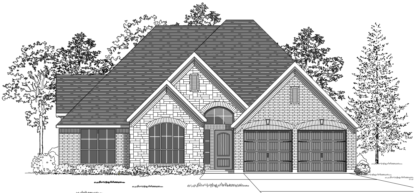
Design 2501W E-30

This design, as originally designed and prior to any changes you make, is estimated to yield approximately the number of square feet shown on page 1. All dimensions are approximate. Square footage may vary based on as-built dimensions, configurations, plan options and/or the method of calculation. Designs are not-to-scale, and are conceptual illustrations that may differ from construction plans or completed improvements. A design may depict features not available on all homesites or in all communities. Perry Homes reserves the right to make changes in plans and specifications, and to substitute material of similar quality. Prices, terms, promotions, plans, dimensions, features, options, amenities, elevations, designs, square footages, specifications, materials, and availability of homes or communities are subject to change without notice or obligation. All obligations will be governed by a written contract. This design does not constitute a commitment to build a particular floor plan or home in any given community. Some floor plans, options, and/or elevations may not be available on certain homesites or in a particular community and may require additional charges. Please check with Perry Homes to verify current offerings in the communities you are considering. This rendering is the property of Perry Homes, LLC. Any reproduction or exhibition is strictly prohibited. © Perry Homes, LLC 2016