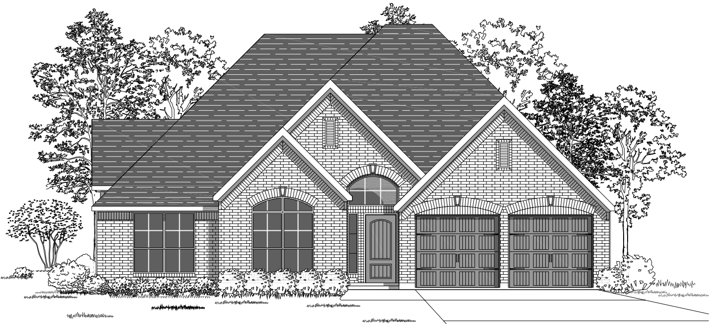
Design 2501W E-2