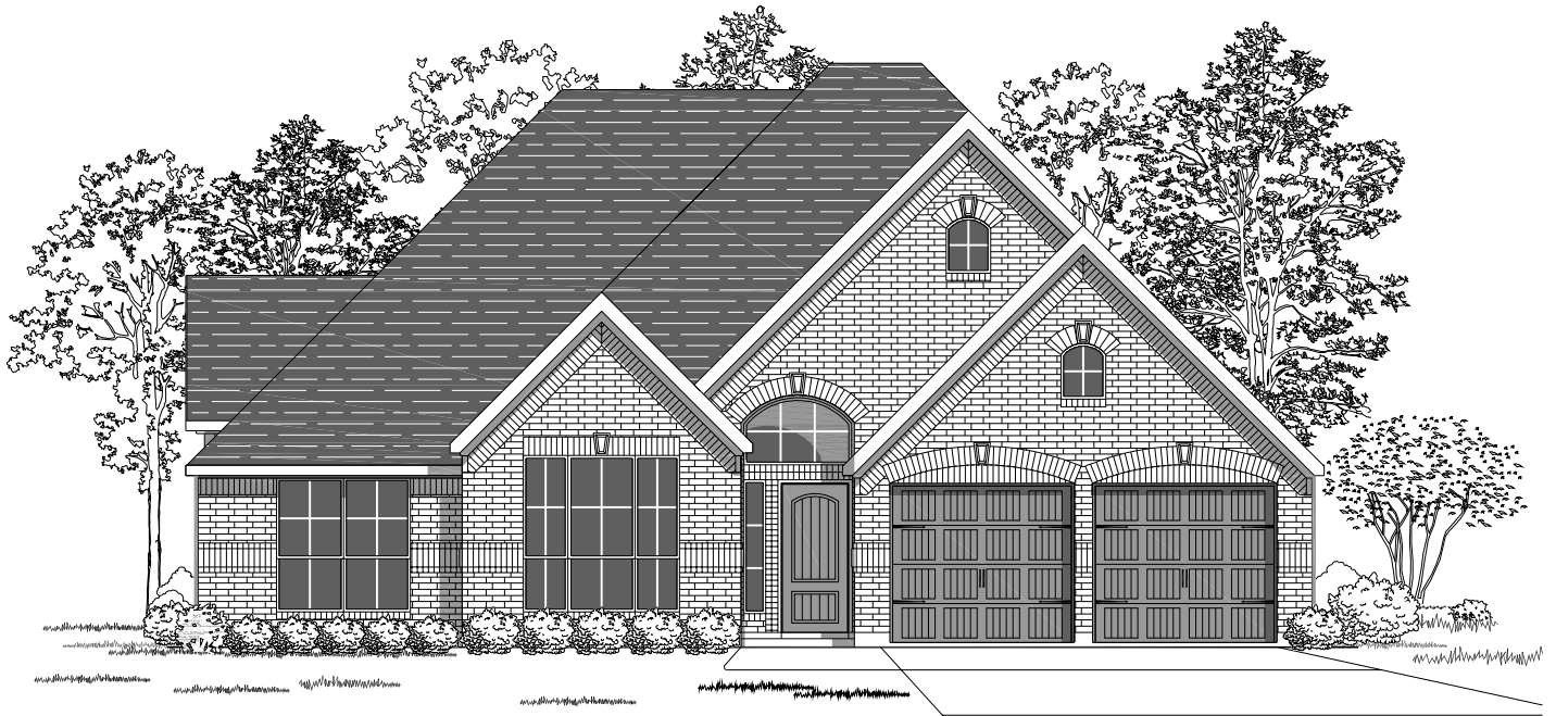
Design 2501W E-1