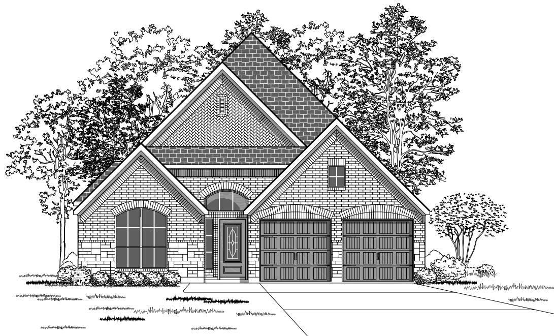
Design 2420W E-30