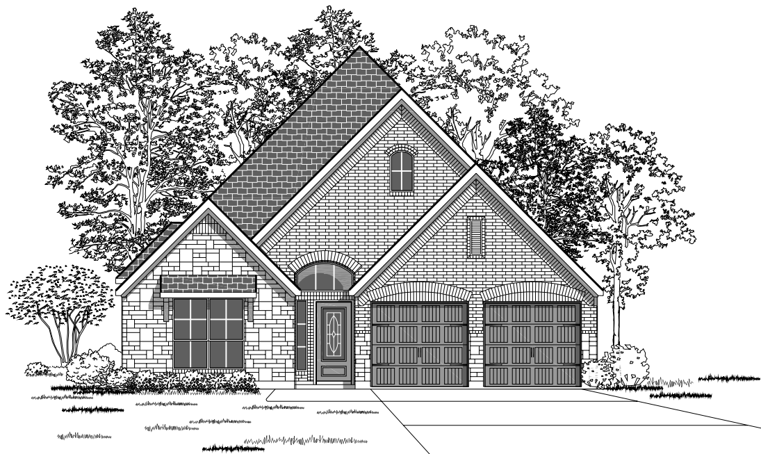
Design 2420W E-50

This design, as originally designed and prior to any changes you make, is estimated to yield approximately the number of square feet shown on page 1. All dimensions are approximate. Square footage may vary based on as-built dimensions, configurations, plan options and/or the method of calculation. Designs are not-to-scale, and are conceptual illustrations that may differ from construction plans or completed improvements. A design may depict features not available on all homesites or in all communities. Perry Homes reserves the right to make changes in plans and specifications, and to substitute material of similar quality. Prices, terms, promotions, plans, dimensions, features, options, amenities, elevations, designs, square footages, specifications, materials, and availability of homes or communities are subject to change without notice or obligation. All obligations will be governed by a written contract. This design does not constitute a commitment to build a particular floor plan or home in any given community. Some floor plans, options, and/or elevations may not be available on certain homesites or in a particular community and may require additional charges. Please check with Perry Homes to verify current offerings in the communities you are considering. This rendering is the property of Perry Homes, LLC. Any reproduction or exhibition is strictly prohibited.