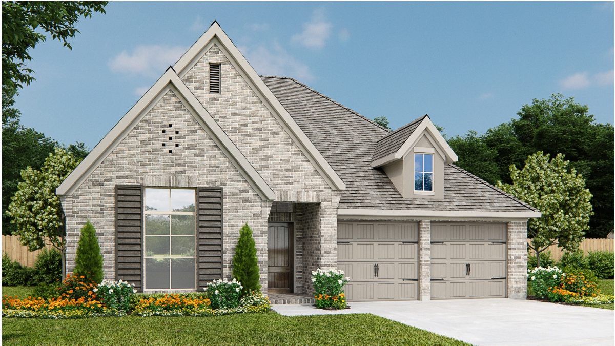
Design 2352W E-1