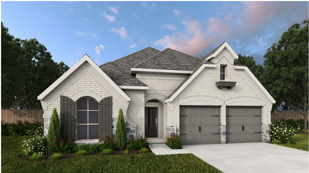
Design 2352W E-30

This design, as originally designed and prior to any changes you make, is estimated to yield approximately the number of square feet shown on page 1. All dimensions are approximate. Square footage may vary based on as-built dimensions, configurations, plan options and/or the method of calculation. Designs are not-to-scale, and are conceptual illustrations that may differ from construction plans or completed improvements. A design may depict features not available on all homesites or in all communities. Perry Homes reserves the right to make changes in plans and specifications, and to substitute material of similar quality. Prices, terms, promotions, plans, dimensions, features, options, amenities, elevations, designs, square footages, specifications, materials, and availability of homes or communities are subject to change without notice or obligation. All obligations will be governed by a written contract. This design does not constitute a commitment to build a particular floor plan or home in any given community. Some floor plans, options, and/or elevations may not be available on certain homesites or in a particular community and may require additional charges. Please check with Perry Homes to verify current offerings in the communities you are considering. This rendering is the property of Perry Homes, LLC. Any reproduction or exhibition is strictly prohibited.