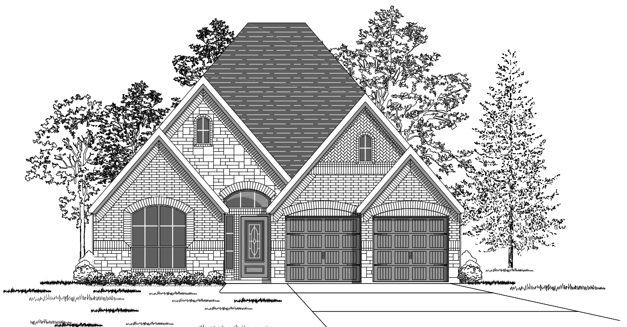
Design 2267W E-55