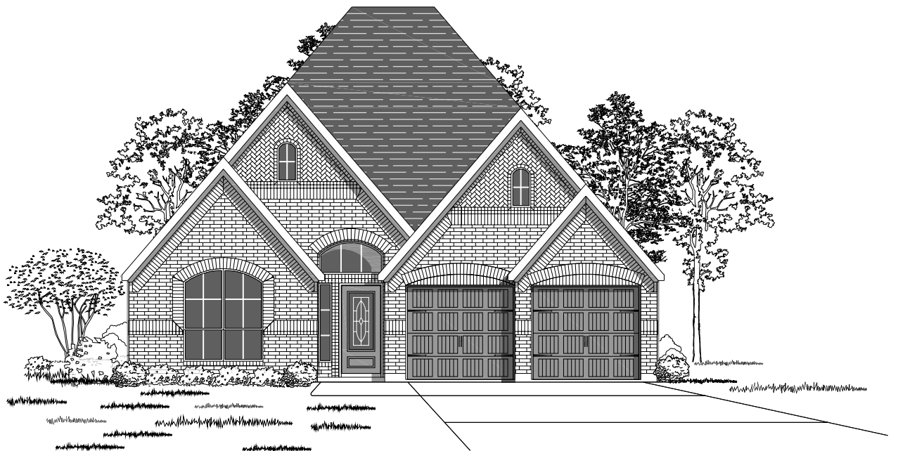
Design 2267W E-32