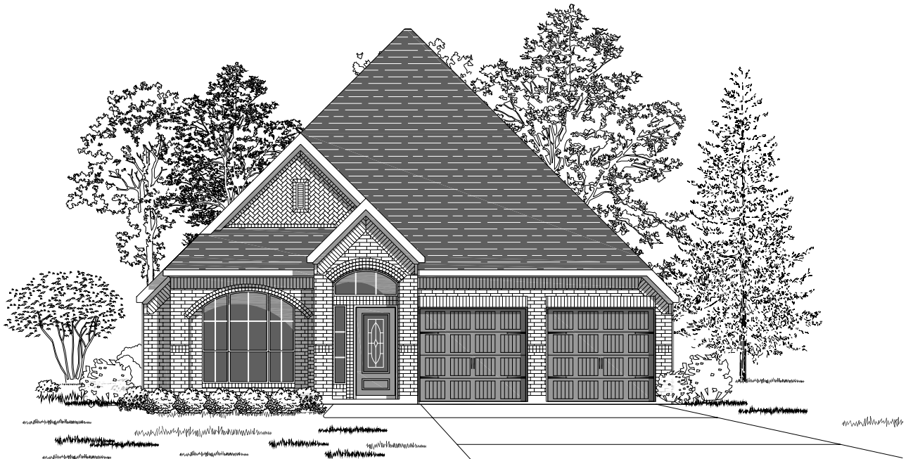
Design 2267W E-53 Includes Large Front Porch