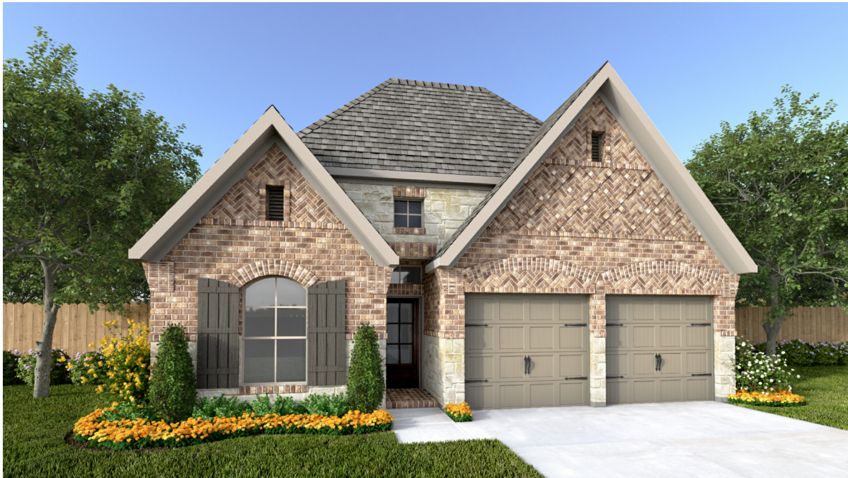
Design 2188W E-30