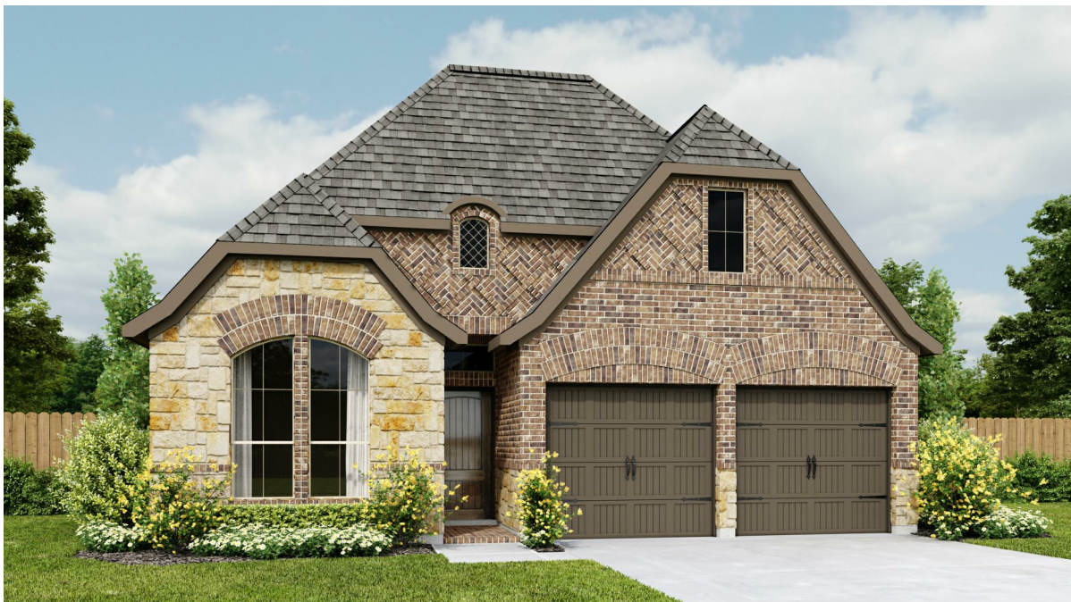
Design 2188W E-31

*See Page 3 for Details and Disclaimers. © Perry Homes, LLC 2019