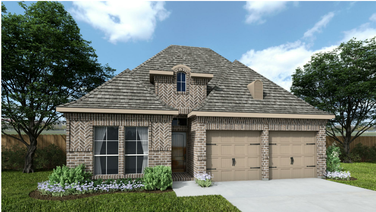
Design 2188W E-1