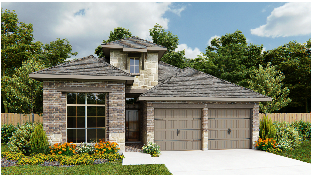
Design 2180W E-71

*See Page 3 for Details and Disclaimers. © Perry Homes, LLC 2020