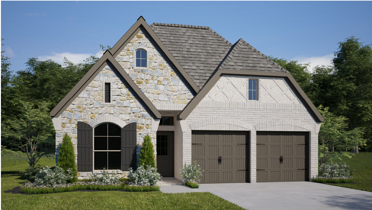
Design 2180W E-50