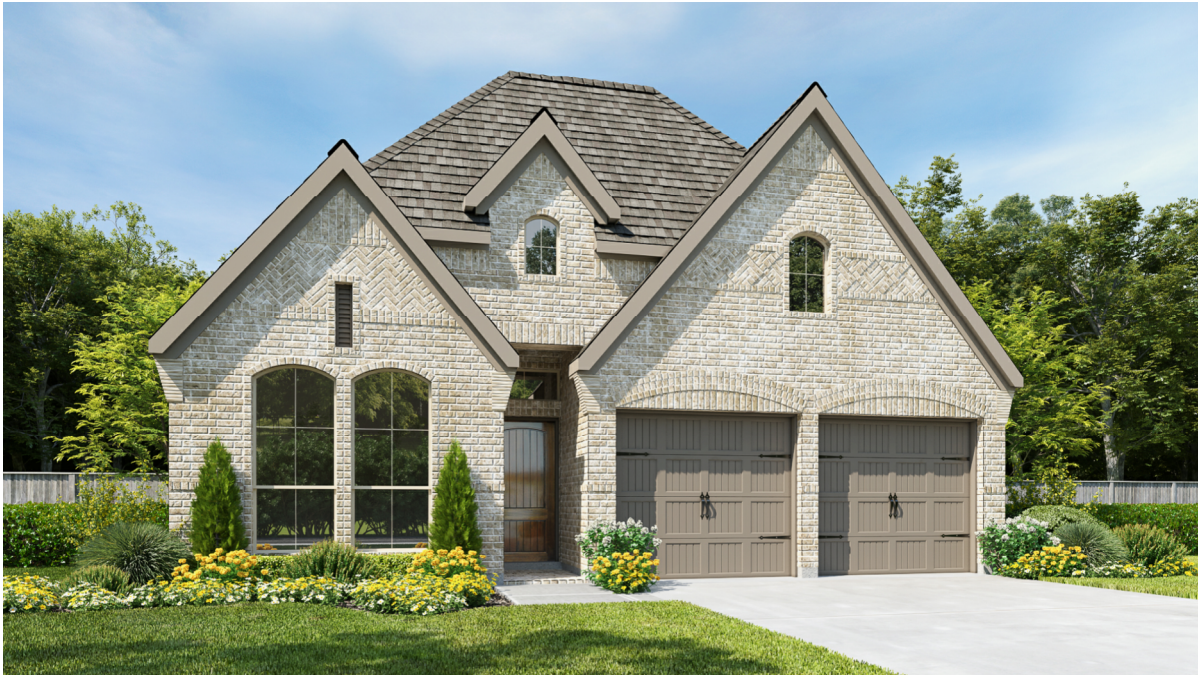
Design 2180W E-1