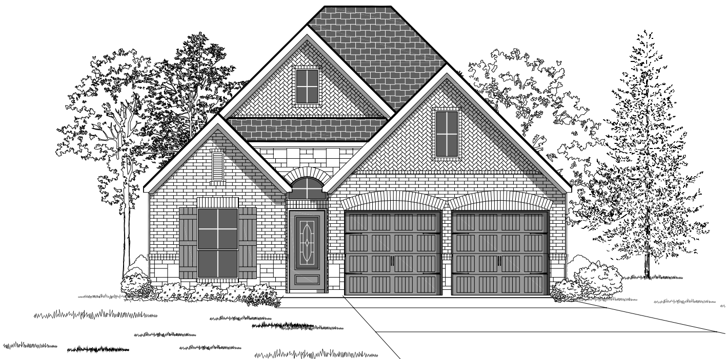
Design 2026W E-50