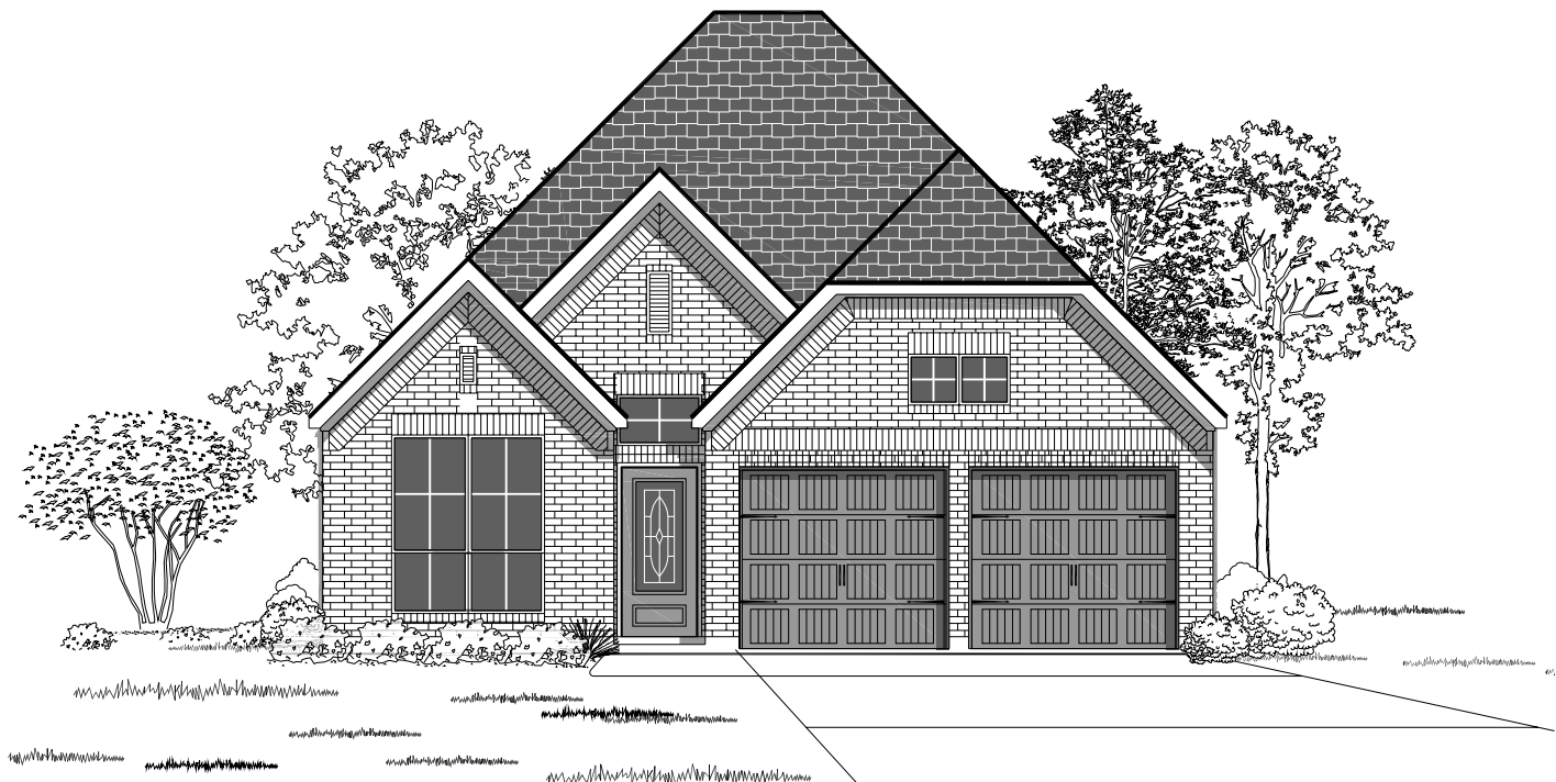
Design 2026W E-1