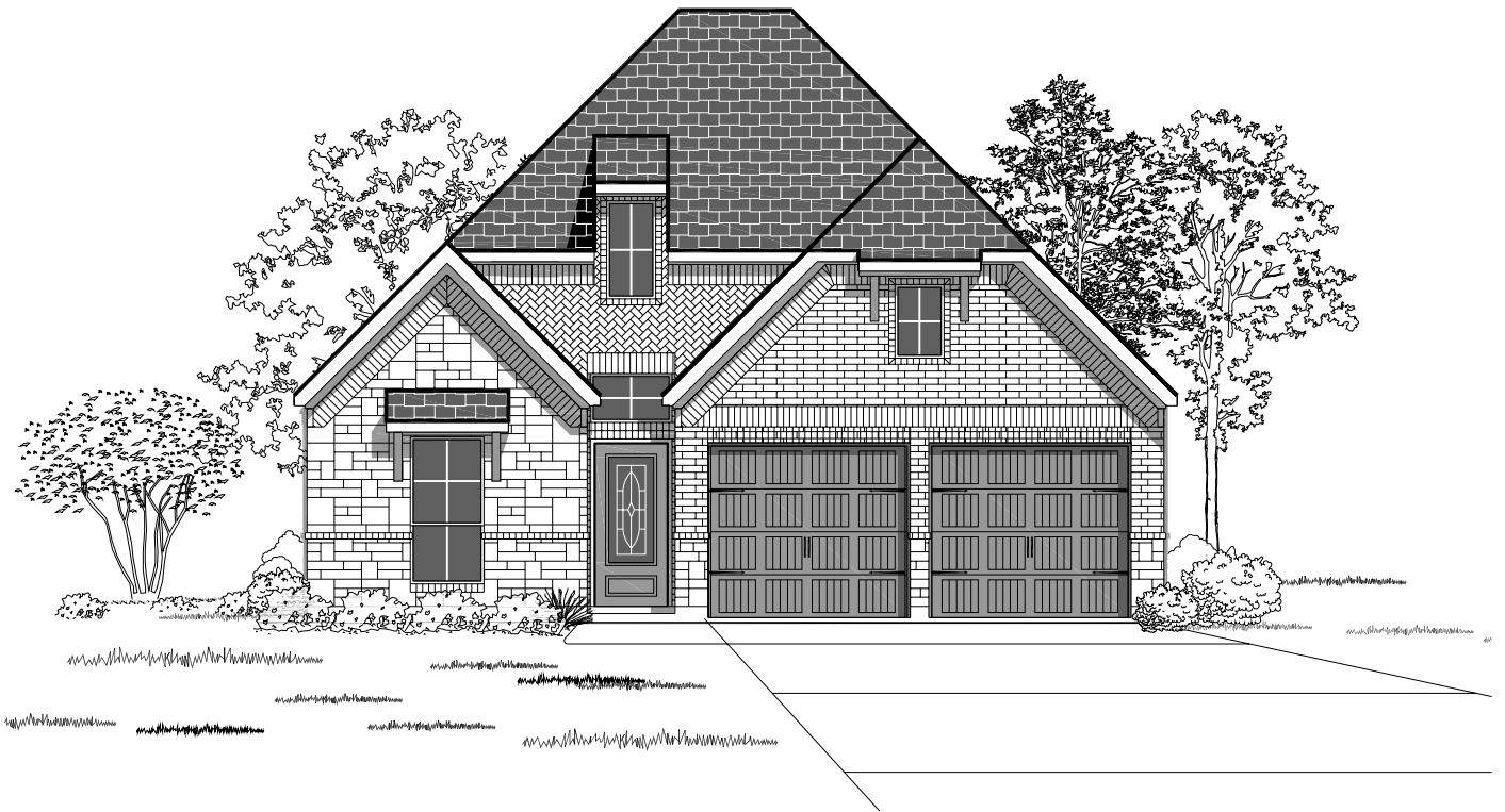
Design 2026W E-51

This design, as originally designed and prior to any changes you make, is estimated to yield approximately the number of square feet shown on page 1. All dimensions are approximate. Square footage may vary based on as-built dimensions, configurations, plan options and/or the method of calculation. Designs are not-to-scale, and are conceptual illustrations that may differ from construction plans or completed improvements. A design may depict features not available on all homesites or in all communities. Perry Homes reserves the right to make changes in plans and specifications, and to substitute material of similar quality. Prices, terms, promotions, plans, dimensions, features, options, amenities, elevations, designs, square footages, specifications, materials, and availability of homes or communities are subject to change without notice or obligation. All obligations will be governed by a written contract. This design does not constitute a commitment to build a particular floor plan or home in any given community. Some floor plans, options, and/or elevations may not be available on certain homesites or in a particular community and may require additional charges. Please check with Perry Homes to verify current offerings in the communities you are considering. This rendering is the property of Perry Homes, LLC. Any reproduction or exhibition is strictly prohibited.