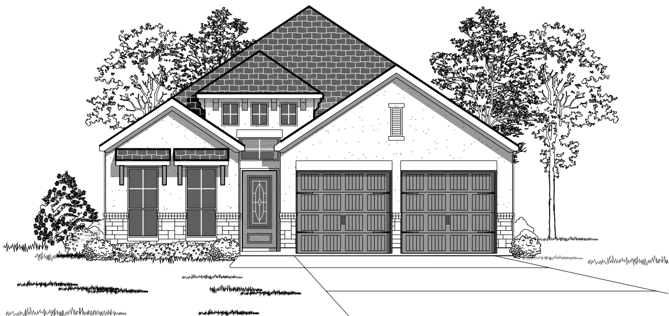
Design 2026W E-70

This design, as originally designed and prior to any changes you make, is estimated to yield approximately the number of square feet shown on page 1. All dimensions are approximate. Square footage may vary based on as-built dimensions, configurations, plan options and/or the method of calculation. Designs are not-to-scale, and are conceptual illustrations that may differ from construction plans or completed improvements. A design may depict features not available on all homesites or in all communities. Perry Homes reserves the right to make changes in plans and specifications, and to substitute material of similar quality. Prices, terms, promotions, plans, dimensions, features, options, amenities, elevations, designs, square footages, specifications, materials, and availability of homes or communities are subject to change without notice or obligation. All obligations will be governed by a written contract. This design does not constitute a commitment to build a particular floor plan or home in any given community. Some floor plans, options, and/or elevations may not be available on certain homesites or in a particular community and may require additional charges. Please check with Perry Homes to verify current offerings in the communities you are considering. This rendering is the property of Perry Homes, LLC. Any reproduction or exhibition is strictly prohibited.