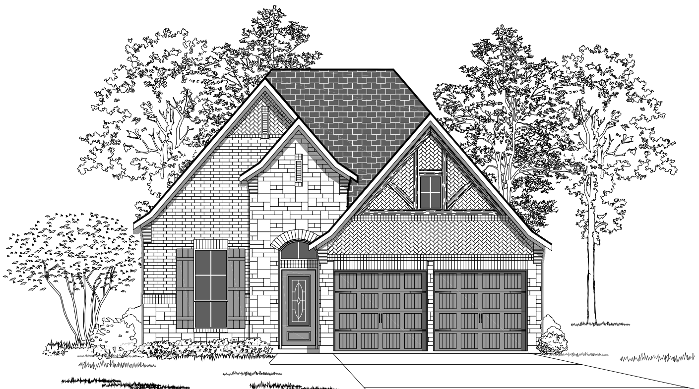
Design 1950W E-70