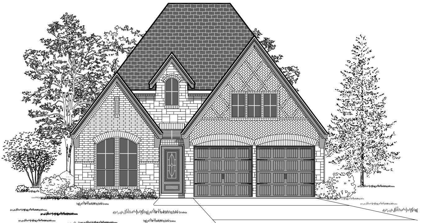
Design 1950W E-52