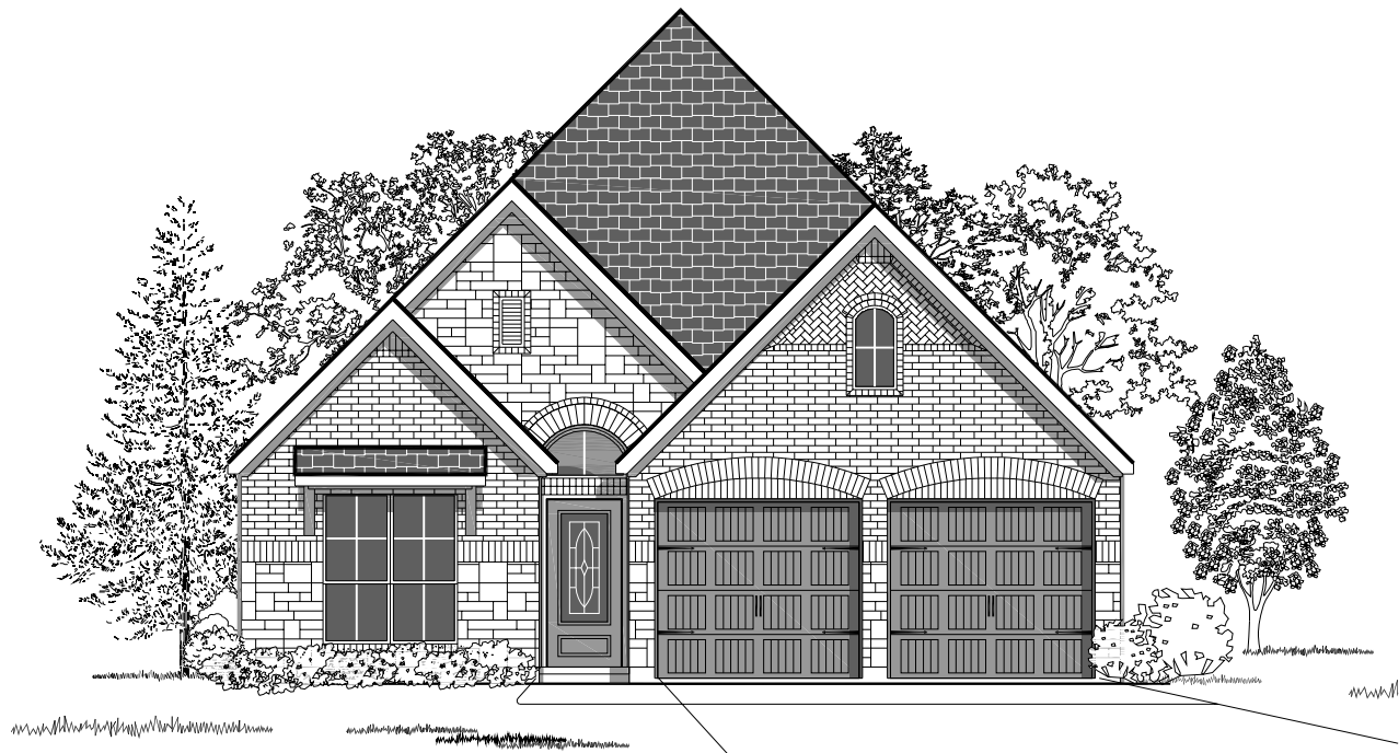
Design 1950W E-33