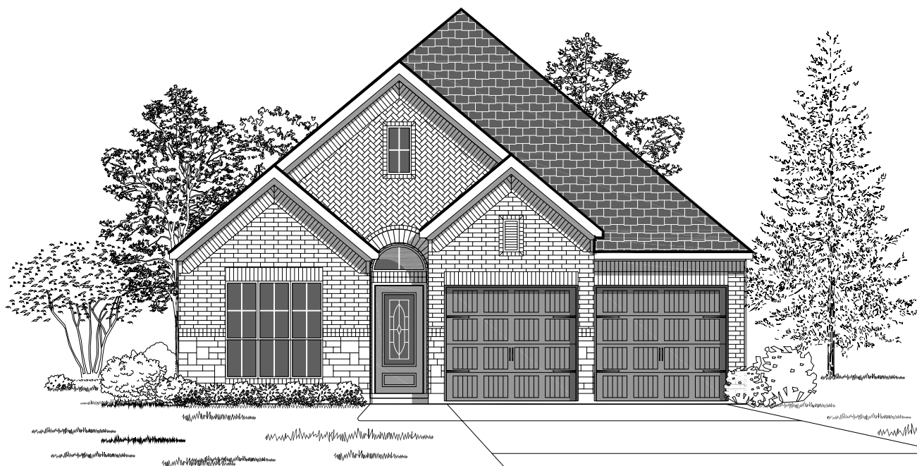
Design 1950W E-32

This design, as originally designed and prior to any changes you make, is estimated to yield approximately the number of square feet shown on page 1. All dimensions are approximate. Square footage may vary based on as-built dimensions, configurations, plan options and/or the method of calculation. Designs are not-to-scale, and are conceptual illustrations that may differ from construction plans or completed improvements. A design may depict features not available on all homesites or in all communities. Perry Homes reserves the right to make changes in plans and specifications, and to substitute material of similar quality. Prices, terms, promotions, plans, dimensions, features, options, amenities, elevations, designs, square footages, specifications, materials, and availability of homes or communities are subject to change without notice or obligation. All obligations will be governed by a written contract. This design does not constitute a commitment to build a particular floor plan or home in any given community. Some floor plans, options, and/or elevations may not be available on certain homesites or in a particular community and may require additional charges. Please check with Perry Homes to verify current offerings in the communities you are considering. This rendering is the property of Perry Homes, LLC. Any reproduction or exhibition is strictly prohibited.