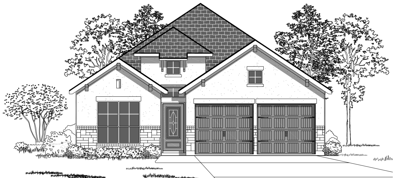
Design 1950W E-51