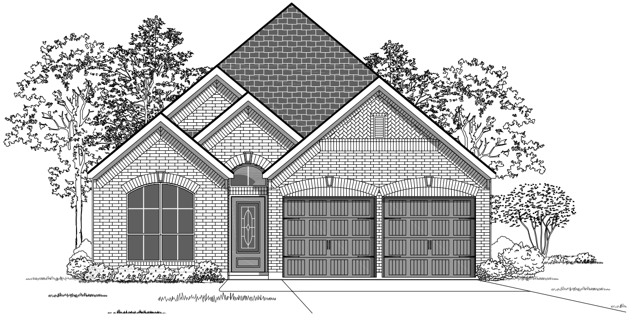
Design 1950W E-1