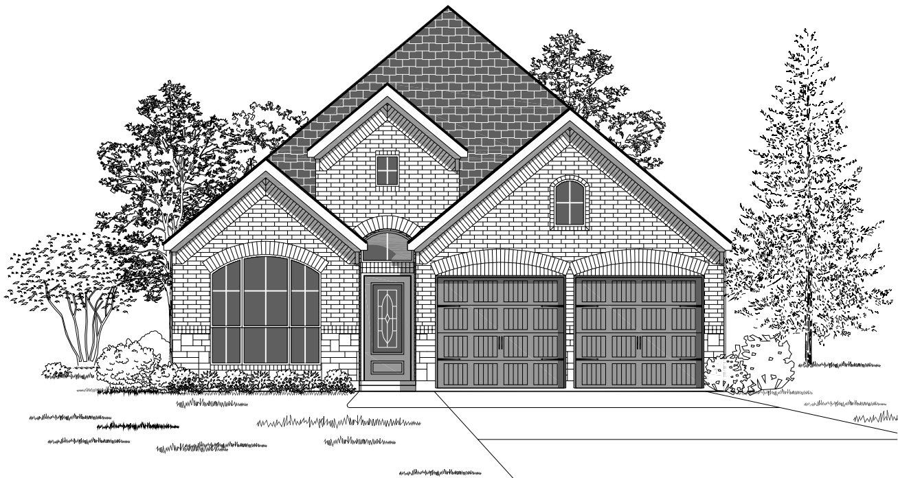
Design 1950W E-31